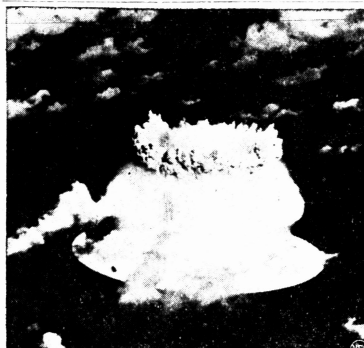
HAPPY BAKER DAY—Maybe they called it "Baker Day" because they knew something like this would show up. This photo, taken by automatic camera just after the characteristic mushroom cloud starting to form and looking very much like a fancy birthday cake.

VOL. 45, No. 106. (8 Pages) PAMPA, TEXAS, FRIDAY, AUGUST 9, 1946. Price 5 Cents AP Leased Wire