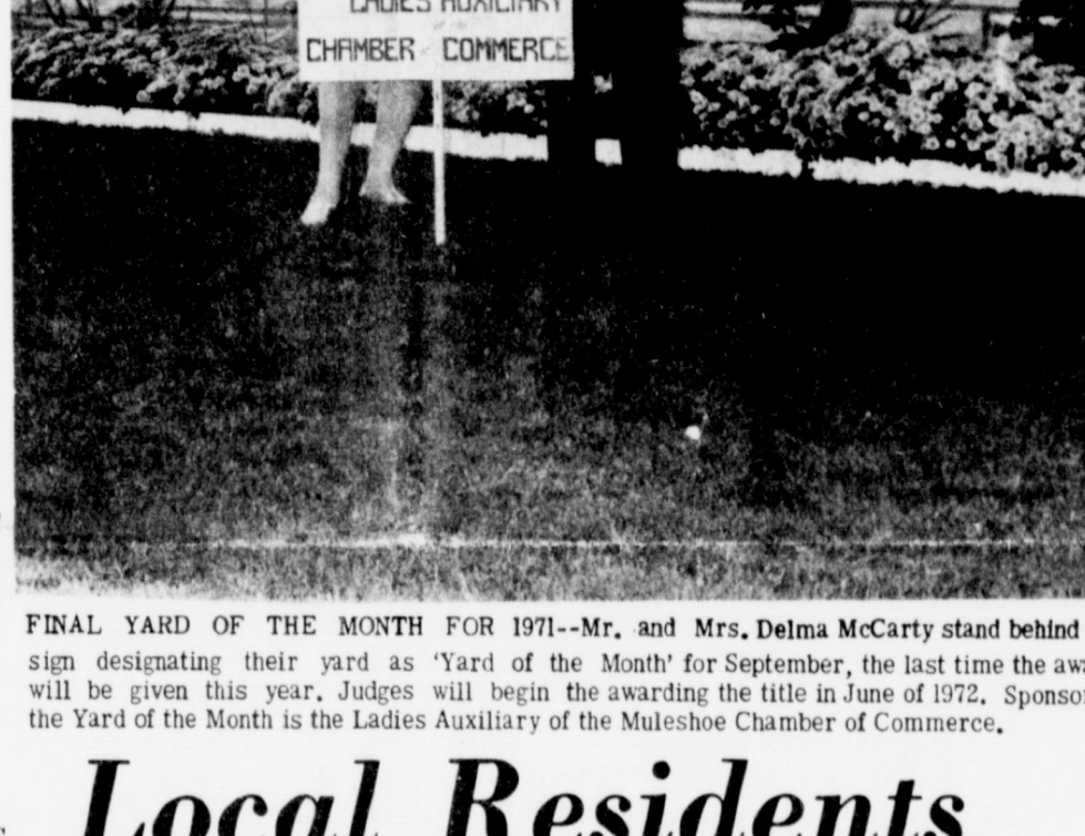
sign designating their yard as 'Yard of the Month' for September, the last time the award will be given this year, Judges will begin the awarding the title in June of 1972. Sponsor of