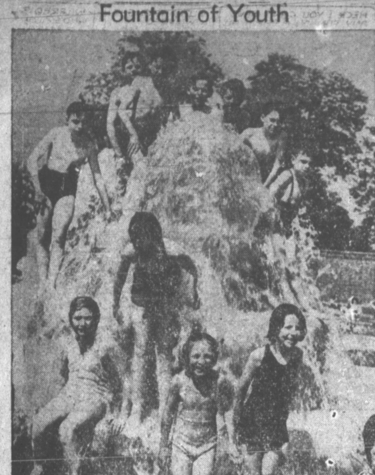
Unlike the Englishman who said he "missed summer last year because he took a nap," these London children lose little time making the most of a recent rare spell of warm, sunny weather—a welcome change after one of the worst winters in the country's history. Here they enjoy the cooling waters of a fountain in Brockwell Park.