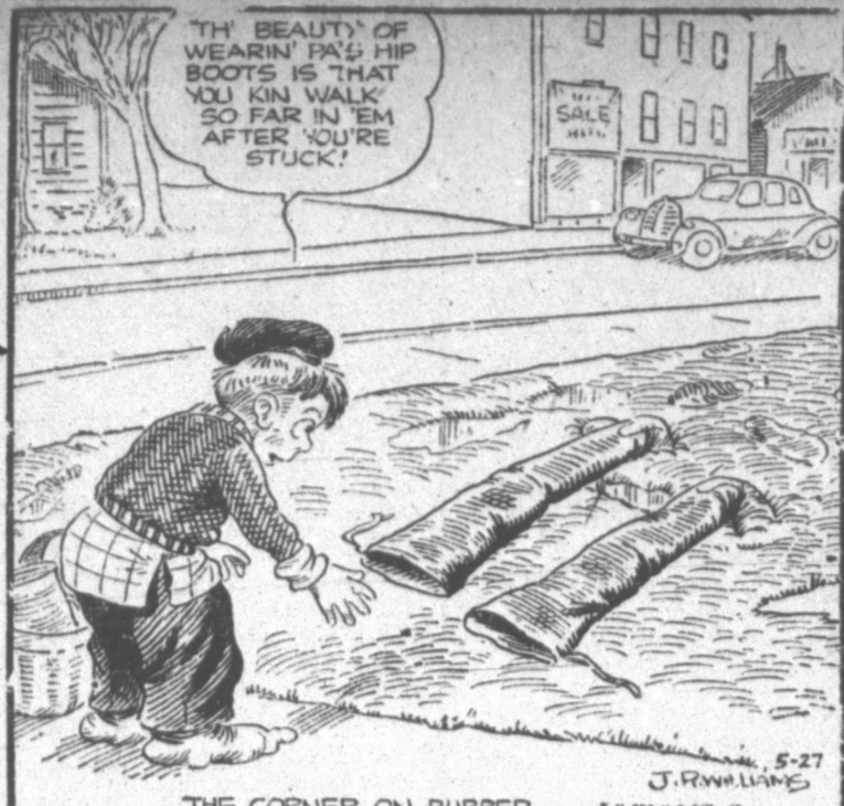
THE CORNER ON RUBBER

common cows 11.00-13.00; canners 8.00-11.00; bulls 10.00-15.00; food and choice fat calves 16.00-23.00; common to medium calves 14.00-18.50.