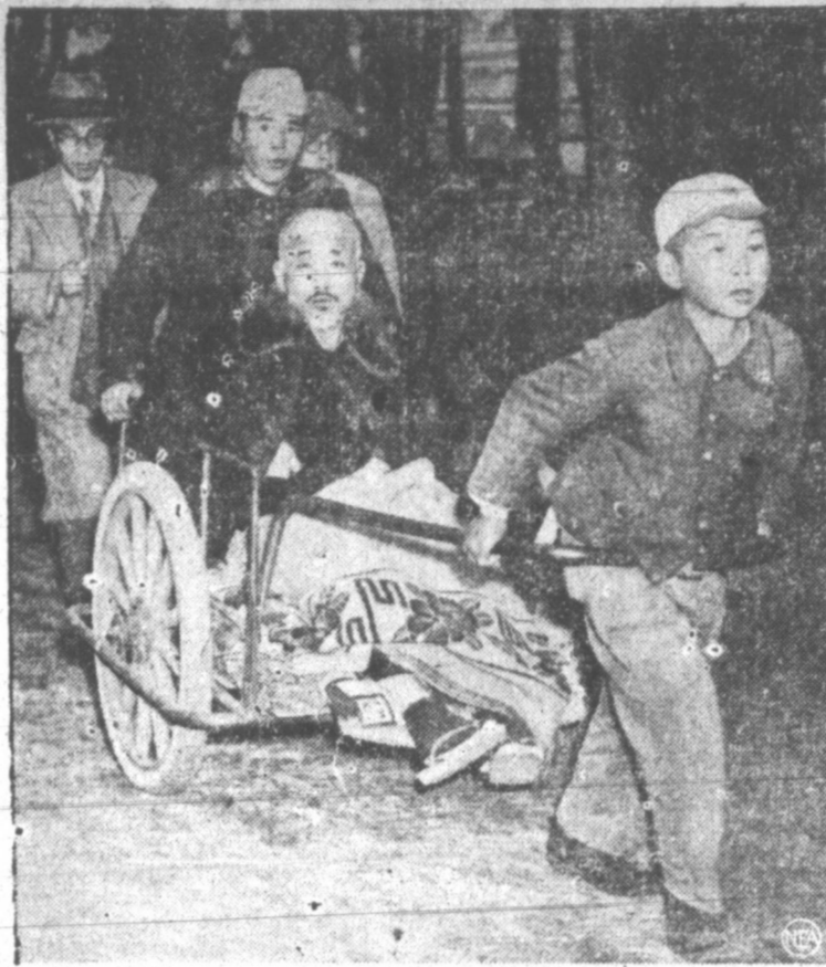
Seated on a pile of straw, Japanese Gen. Kanji Ishihara is trundled on a rubber-tired cart from his home to testify before the International Military Commission for the Far East at Fukuoka. Commission members journeyed 300 miles from Tokyo to meet Ishihara. "The doctor's diagnosis declared him too ill to go to Jap capital."