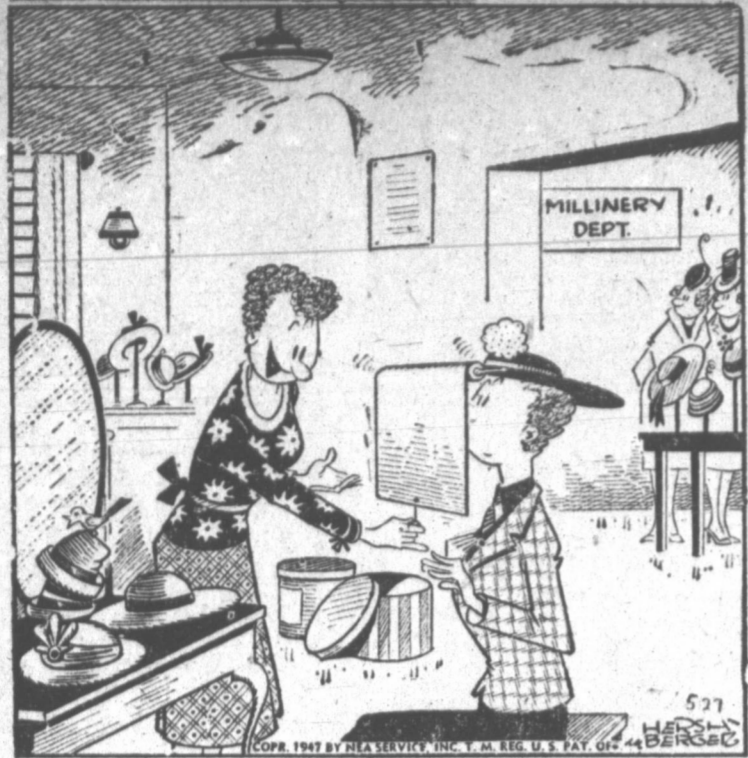
"And when someone sits across from you on a street car, just pull the shade!"