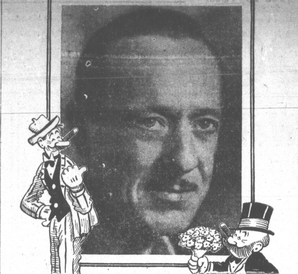
MUTT AND JEFF take note of the "boss" here. The "boss" is Bud Fisher, who, as you probably know, creates the character for the comic page readers. They start their antics tomorrow in The Pampa Daily News, and the boys are bringing him flowers for securing The News audience of readers of selected comics.

Total number of deaths from cancer in 1929 was 111,569.