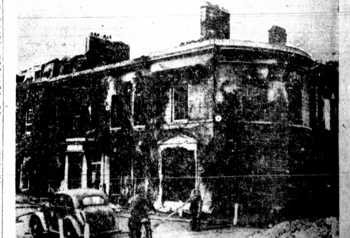
PRINCESS ELIZABETH'S BURNED-OUT HONEYMOON HOME - Here are the fire-swept Mansion in England, where Princess Elizabeth and Lt. Philip wedding. The blaze in the 25-room home damaged the royal