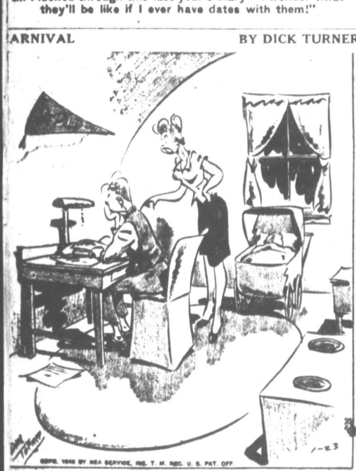
ARNAVAL BY DICK TURNER