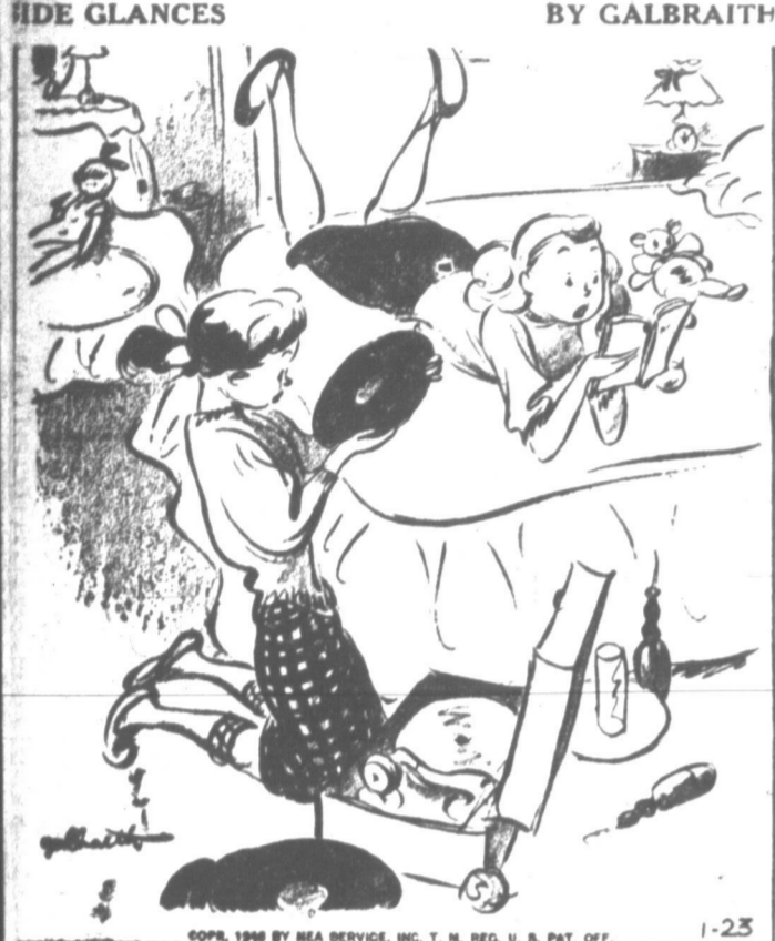
HIDE GLANCES BY GALBRAITH