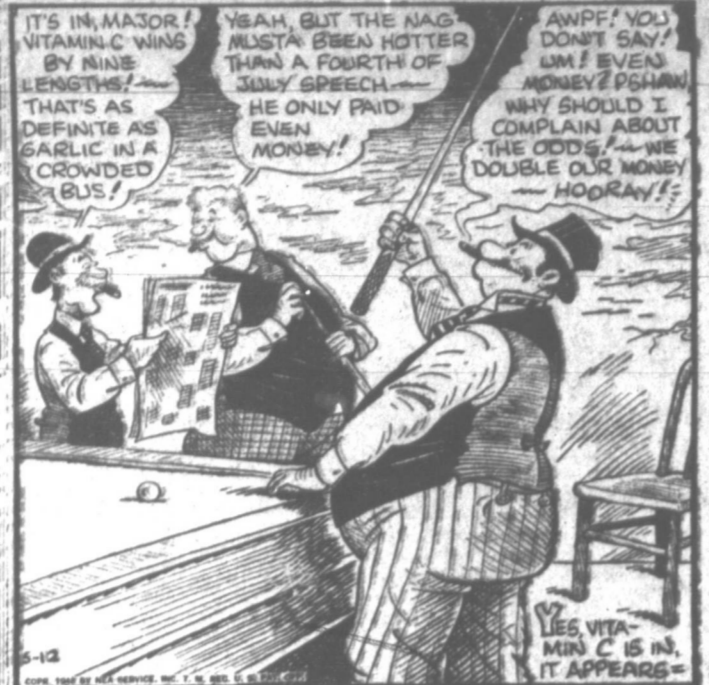
SIDE GANCES BY GALBRAITH