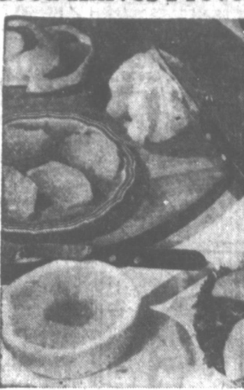
The right knife simplifies preparation of citrus fruit.

By GAYNOR MADDOX NEA Staff Writer Many home experts say the well-equipped kitchen needs at least six pieces of cutlery—paring knife, bread knife, carver, utility slicer, long fork and sharpening steel. The Associated Cutlery Industries of America point out that during the war our metallurgical research developed the finest quality steel, which is now being used for American cutlery. For citrus fruit preparation, the right knife saves time, appearance and the fruit itself. For example, with a grapefruit knife, one "swipe" of the utility knife and the grapefruit is halved, clean, smooth and ready to serve "as is" — or, if you want to serve half a grapefruit with a professional look and for more convenient eating, use the curved grapefruit knife to cut around the outer edge and around the middle "core" to remove it easily. Then cut from center to outer edge between each section. For salads or fruit cup, to get smooth whole segments, peel the skin from the grapefruit with a paring knife, cutting deep enough to remove all the white membrane with the skin. Then separate the sections and peel clean. (One serving) One medium Valencia orange, 1 tablespoon shredded coconut (dry or moist). Slice or dice the peeled orange. Sprinkle or mix with coconut.