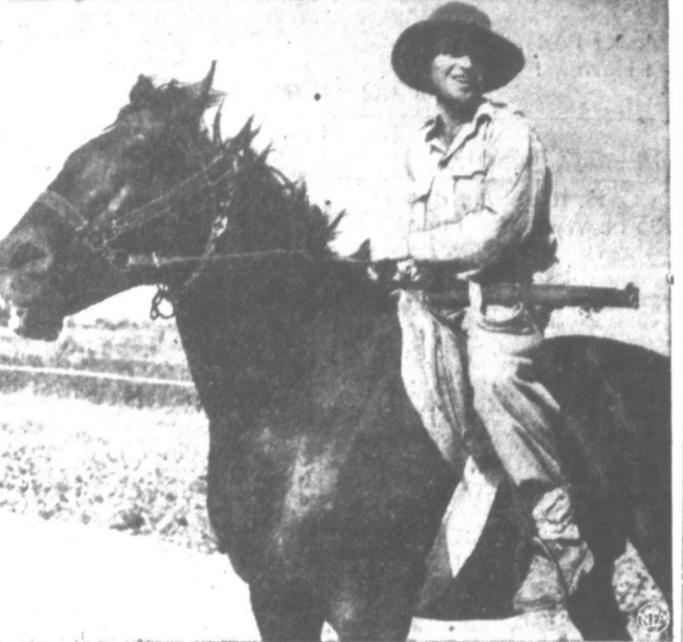
This Jewish cowboy is riding herd in Northern Palestine, near the Lebanese border, although it could be Texas or Montana. He carries a rifle across his saddle, but protect himself against Arab attackers.