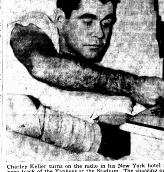
Charley Keller turns on the radio in his New York hotel room to keep track of the Yankees at the Stadium. The slugging outfielder broke a metacarpal bone between the third and fourth fingers of his left hand attempting a shoestrung catch. He was out two-thirds of last season with a fractured disc in his spine.