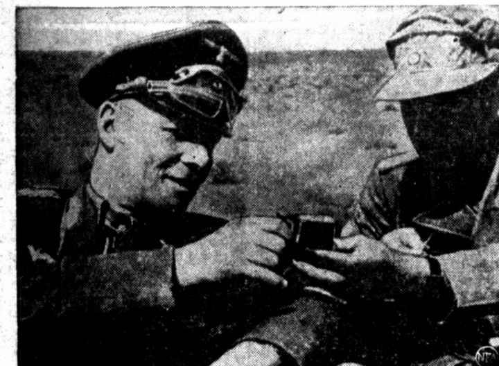
ROMMEL DOES IT AGAIN—Germany's master tank strategist, Marshal Erwin C. Rommel, left, who has again driven most of the British out of Libya, getting a smoke from one of the desert fighters.