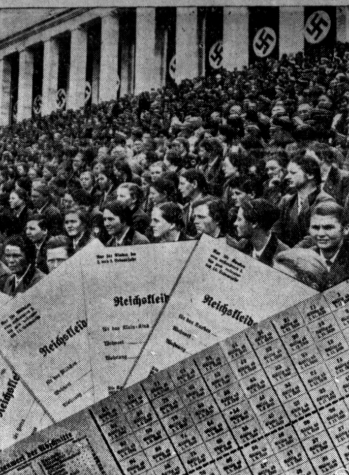
ALTHOUGH WHEN NECESSARY, the German woman dutifully attends political rallies, as at the Nazi mass meeting pictured above, her real interest—and greatest danger as a foe—is in solving the problems represented by the ration cards for food and clothing—keeping the home front intact, breeding and maintaining families, making every necessary sacrifice to help Hitler.

Paint-Up and Clean-Up HOME BUILDERS SUPPLY 312 W. Foster Phone 1414