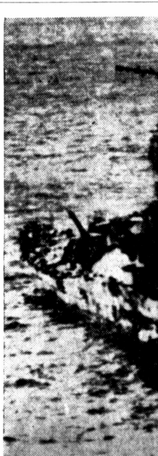
BATTERED JAP CRUISER LIES SMOKING AFTER MIDWAY BATTLE—The smoking ruin of a heavy Japanese cruiser of the Magami class, wrecked by U. S. Navy carrier-based aircraft in the recent battle for Midway Island. Photo passed by U. S. Navy department, bureau of public relations, Washington, D. C. Note the half-launched torpedo hanging from the ship's side.