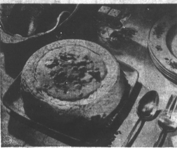
A spaghetti ring makes novel housing for tuna in a king.

By GATNOR MADDOX NEA Staff Writer Fish, either canned or salted, keeps well on the pantry shelf. But don't keep it there too long if you are looking for good protein food all the family will enjoy.