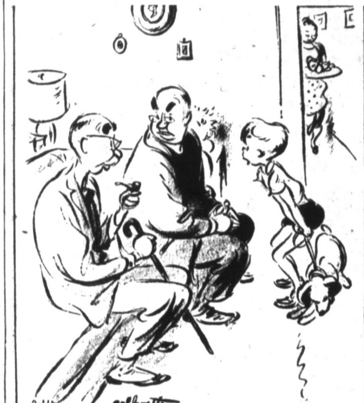
"Tower won't perform any tricks today—do you want to hear grandpa do his funny imitation of you giving a sermon?"