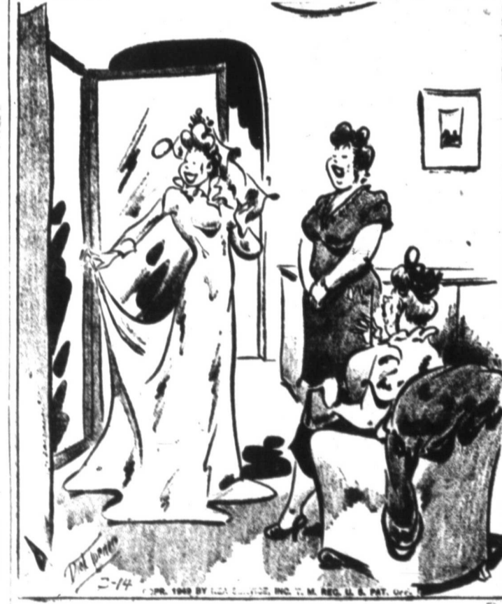
"At that price we don't make much on such a beautiful wedding gown, but we make it up in repeat business!"