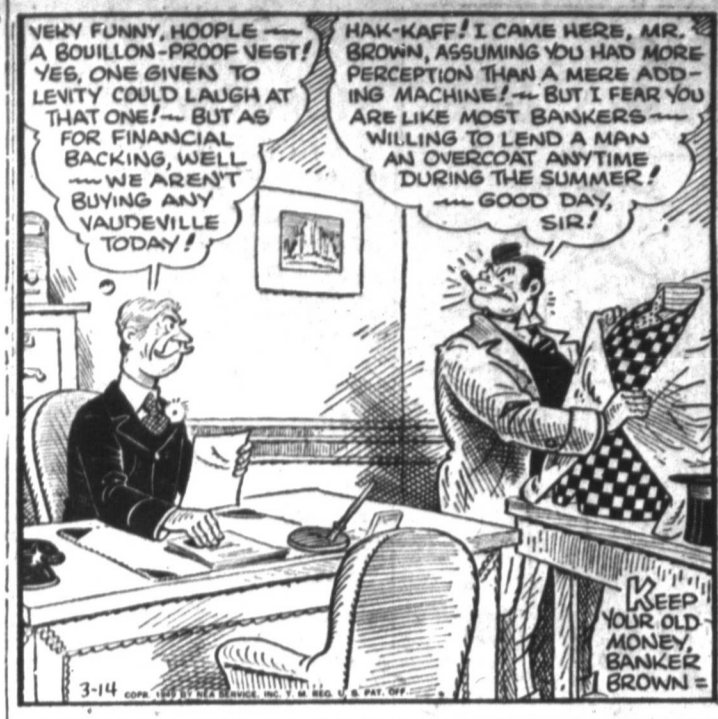
KEEP YOUR OLD MONEY, BANKER BROWN