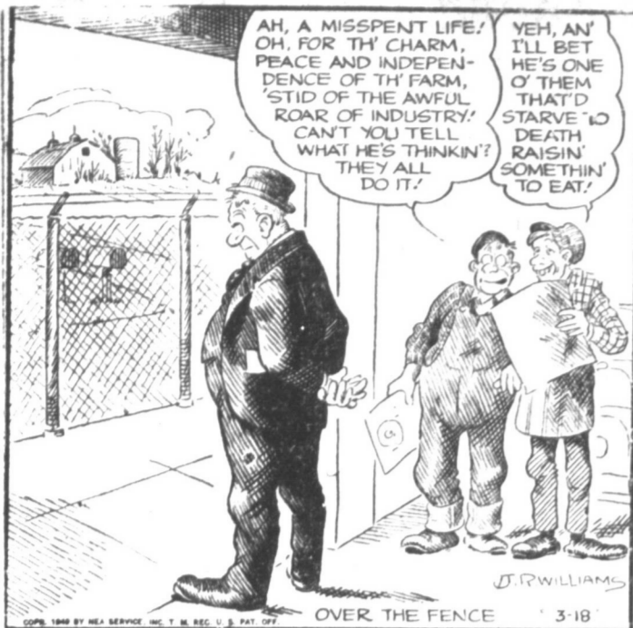
OVER THE FENCE 3-18