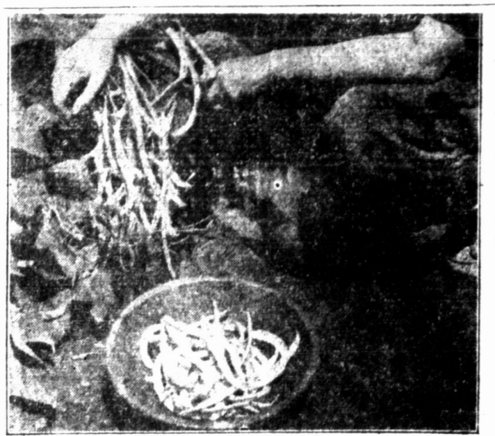
Wax beans are considered by many to be tenderest of all.