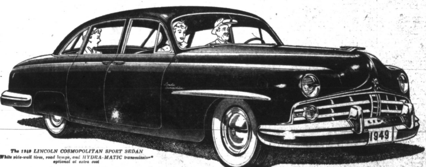
The 1949 LINCOLN COSMOPOLITAN SPORT SEDAN. White side-wall tires, road lamps, and HYDRA-MATIC transmission—optional at extra cost.