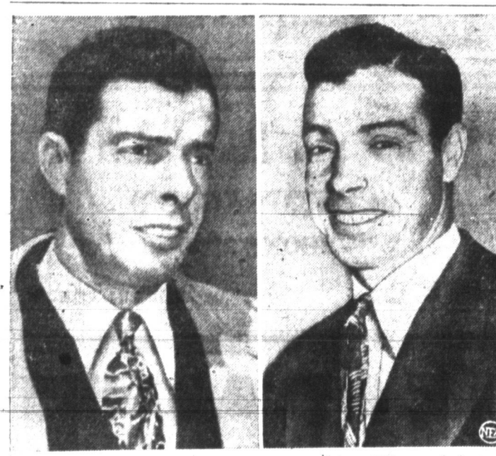
BEFORE AND AFTER—There is a tremendous difference between Joe DiMaggio, the victim of America's No. 1 heel, and the Yankee Clipper clouting home runs in clusters.