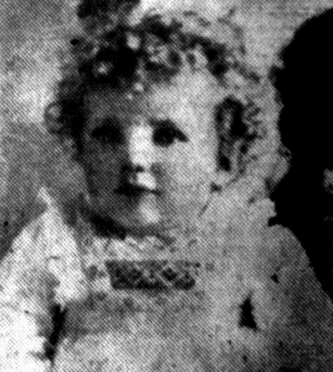
THE GOVERNOR at the age of 16 months.