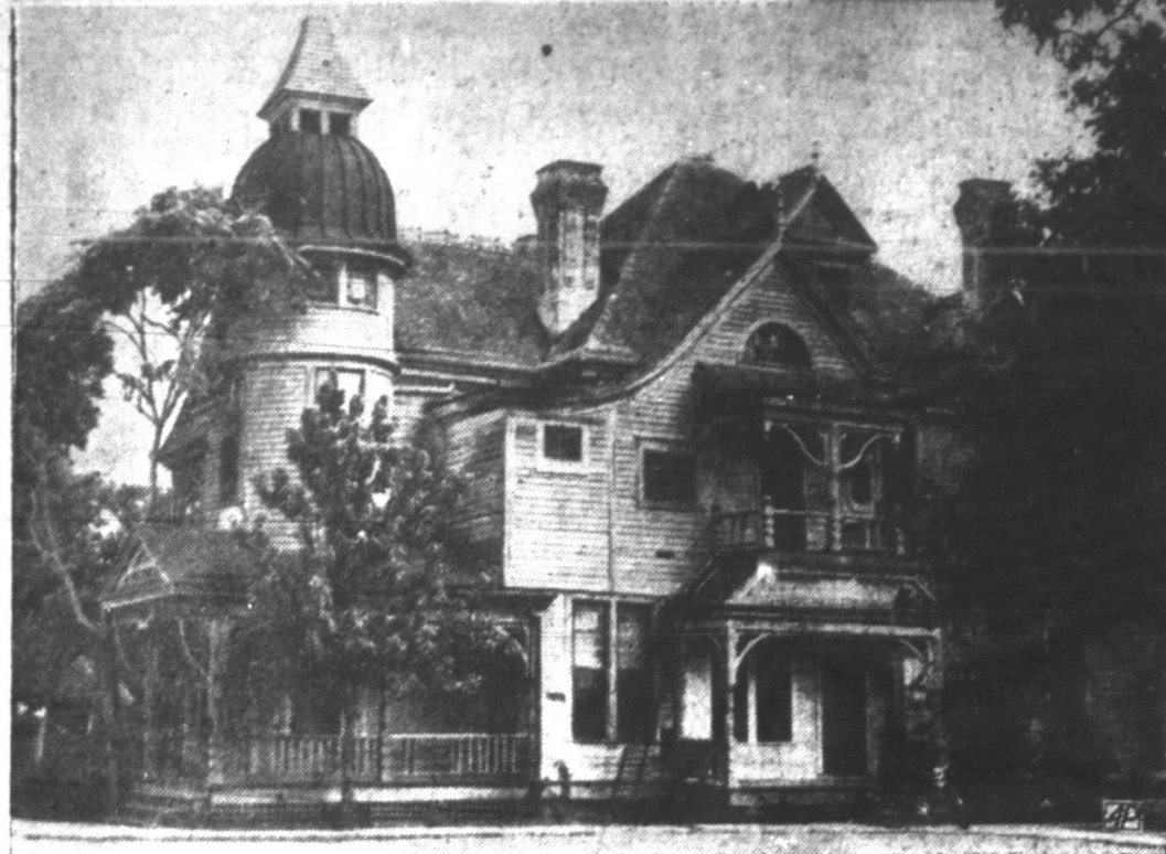
BIRTHPLACE—In this rambling old Corsicana house Texas' Governor Jester was born 86 years ago.