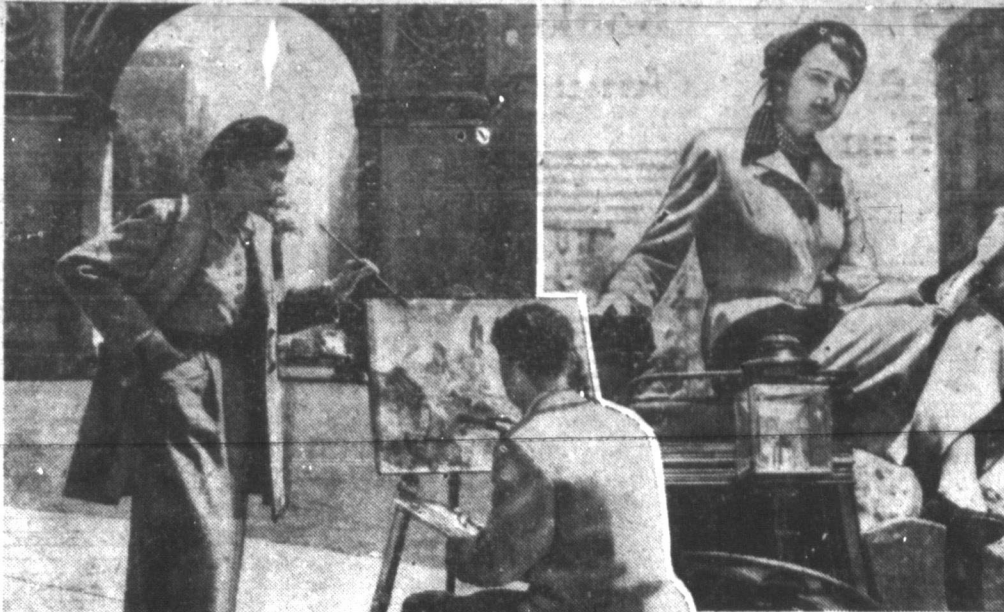
Old fashioned kasha cloth returns to make high-styled suits. Black yarn trims hipline and collar of jacket (above) which tops the blouse, lines the jacket.

By EPSIE KINARD-NEA Fashion Editor NEW YORK —(NEA)— Fine fabrics aid and abet the new suit in flagging eyes to its 1950 look. Take tweeds, which are drawing glances their way from every direction. Whether fine or coarse-grained, nubby or smooth, homespun looking or highly-textured, tweed is an eye-catcher. That's particularly so when it appears in surprise colors. Mauve and