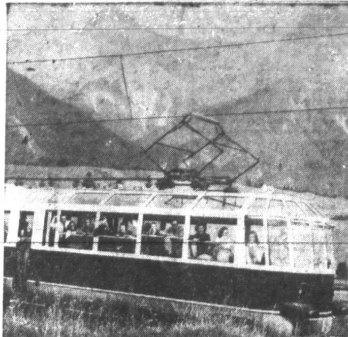
FOR ALPS SIGHTSEERS—Damaged during the war, this glass sightseeing train, seating 72, is back in service again en route to Garmisch-Partenkirchen in the Bavarian Alps.