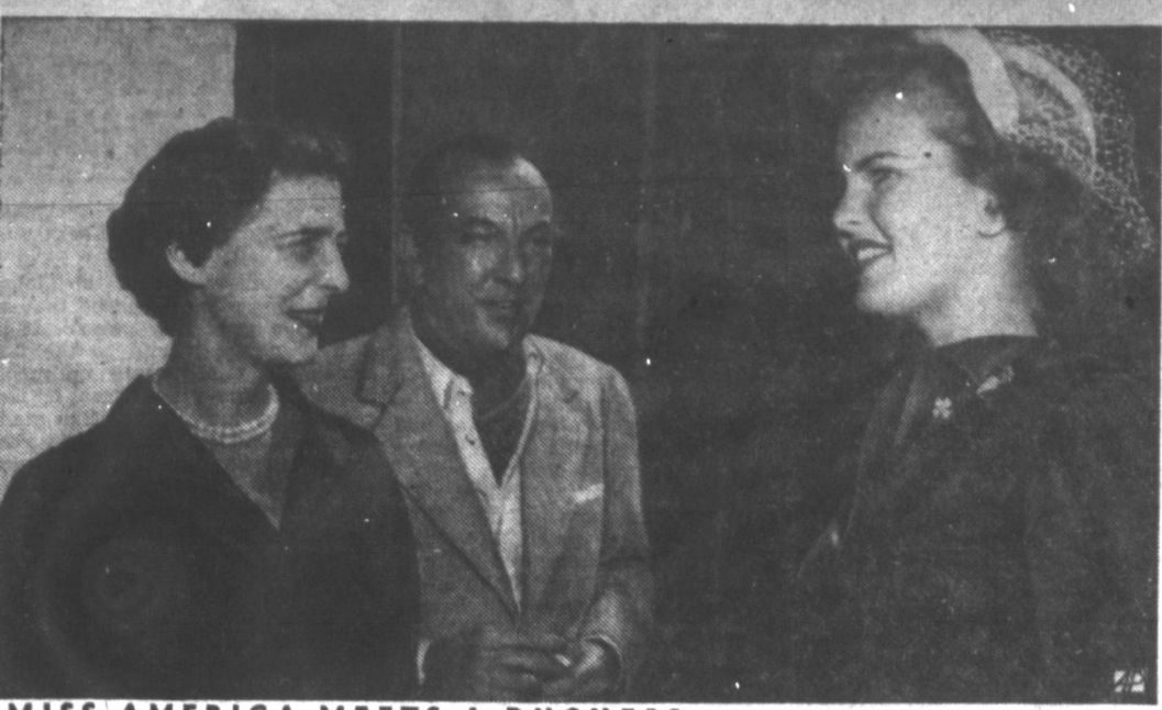
MISS AMERICA MEETS A DUCHESS — Bebe Shopp, Miss America of 1948, (right) meets Duchess of Kent at London studio of Noel Coward (center) where both were guests.