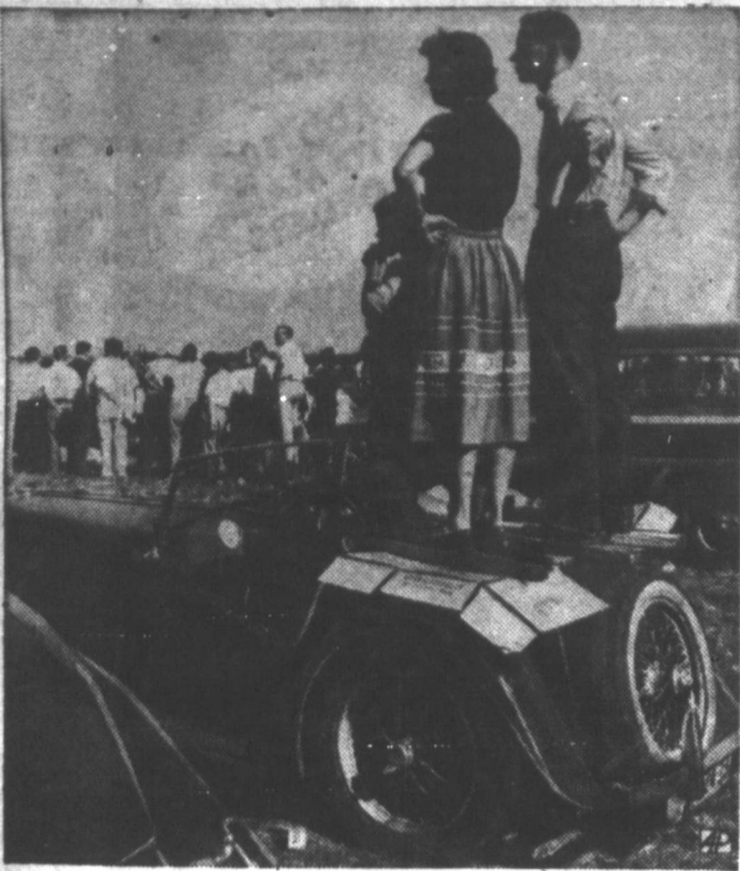
PRIVATE GRANDSTAND — This couple turned the rear of their sports car into a private grandstand during the road races for foreign cars on the runway of Linden, N. J., airport.