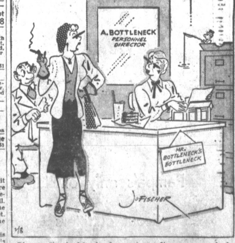
Oh, ye, I've had loads of experience. I've never worked more than two weeks for ANY company.