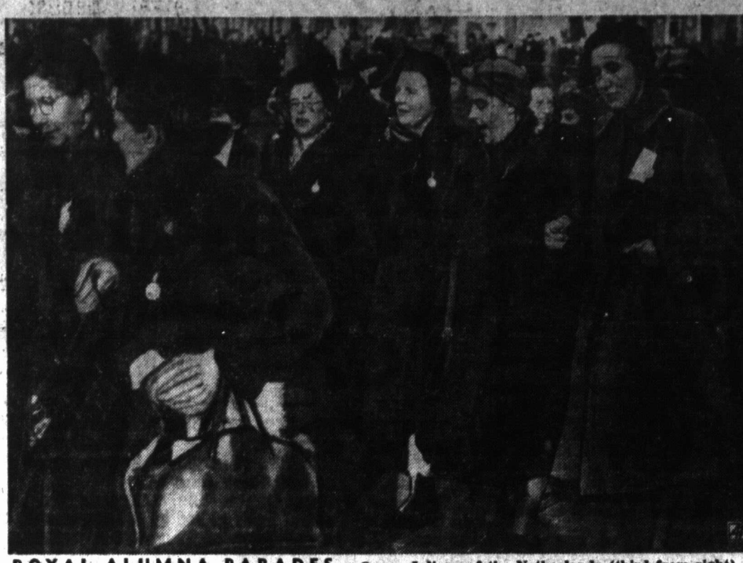
ROYAL ALUMNA PARADES—Queen Juliana of the Netherlands (third from right) marches with alumnae of Leyden University at the annual feast of the women undergraduates.

MARKETS FORT-WORTH LIVESTOCK FEB. 8 (AP)—Cattle: 1,000 calves 24.00-25.00; calves 26 months and over 24.00-25.00; yearlings 24.00-25.00; steers 24.00-25.00; hogs 15.00-17.00; pigs 11.00-12.00; sheep 11.00-12.00. KANSAS CITY LIVESTOCK KANSAS CITY, Feb. 8 (AP)—Cattle: 200 calves 24.00-25.00; calves 26 months and over 24.00-25.00; yearlings 24.00-25.00; steers 24.00-25.00; hogs 15.00-17.00; pigs 11.00-12.00; sheep 11.00-12.00.