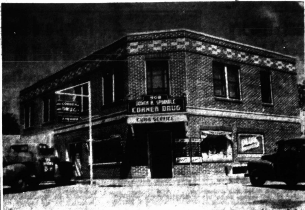
Pampa's Corner Drug Store holds a unique position in the city. Homer Sprinkle manages to keep his popular establishment running in full fashion and remain popular with young and old alike. With drive in service as a feature of the store, you'll never find a dull moment at the Corner Drug.