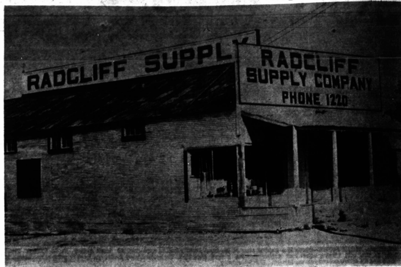
THE VENERABLE Radcliff Supply Company is vital to a large portion of Pampa homes and industry. Unsung and unheralded, it has supplied tubing, hose, tools, belting and other home and industrial needs to Pampans for more than twenty years.

In the hustle and bustle of our everyday lives, we often overlook those segments of business and industry in our Economy which form an integral link in the lifeline of the business—it is so composed that it does not lend itself readily to spontaneous publicity—for the most part, however, we are at fault. We buy their goods as a matter of fact and don't consider the importance of the business on the local scene.