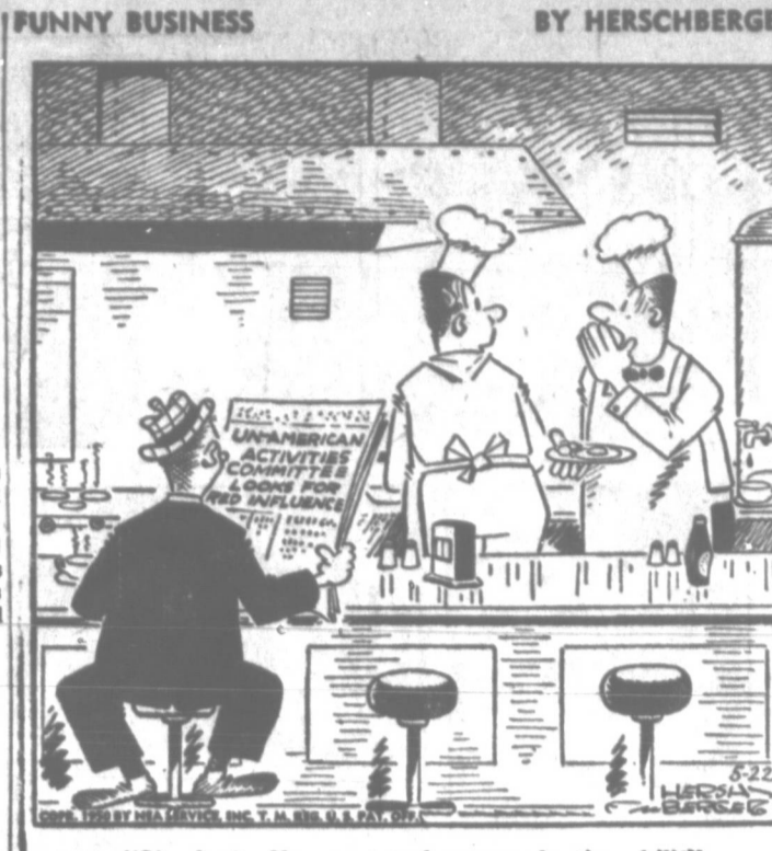
"Sh, Joe! No more red pepper in the chili!"

the natural markings of mahogany and rosewood, without unwanted variation in color. To accomplish this, the rosewood portions are first treated with a clear sealer before the finishing job is begun on the entire piece. Next, a lacquer sealer, which contains a basic stain, is applied to all wood surfaces. The desired color is next built up by a process called hand padding. The necessary shading and finishing lacquer is then applied, and all is hand-rubbed with pumice and oil. Finally, a hard paste wax brings up the brilliant lustre of the lacquer finish. Forced Freedom Pressure by Egyptian nationalists forced Britain to declare Egypt an independent, sovereign state on Feb. 28, 1922, although the British reserved their rights for the protection of Suez and the defense of Egypt. Long Life Daniel Boone, generally associated with the state of Kentucky, where he spent 28 years, lived a total of 87 years in the two states of Pennsylvania and Missouri. Dried Gulf of Mexico shrimp are exported to Hawaii, the Philippines and China.