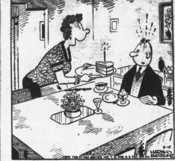
"Happy birthday, dear—the rest of the family couldn't wait for dinner to celebrate it!"

Chinese Air Force To Continue Patrol... TAIPEI, Formosa — (AP) — Nationalist China's air force said today it would continue to patrol the Red China coast and attack Communist craft that might be used to invade Formosa.