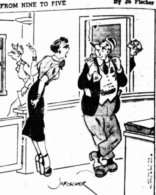
Oh... a subpoena for Mr. Wump? Go right in... I thought you were a salesman.

LEFORS — Arrangements have been made by the Lefors Boy Scout Troop 19 for the presentation of a home talent show, "Uncle Ezra's Hayloft Jamboree." The show will be presented Aug. 21-22 in the Pirate football stadium. The Hayloft Jamboree is patterned after popular barn dance type programs, and uses local amateur talent competing for ribbons and awards by impersonating radio celebrities. Winners will be selected by the vote of the audience attending the show.