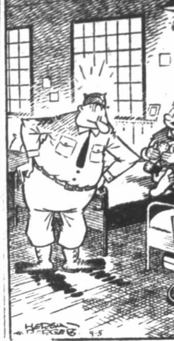
"I think he's new here!"