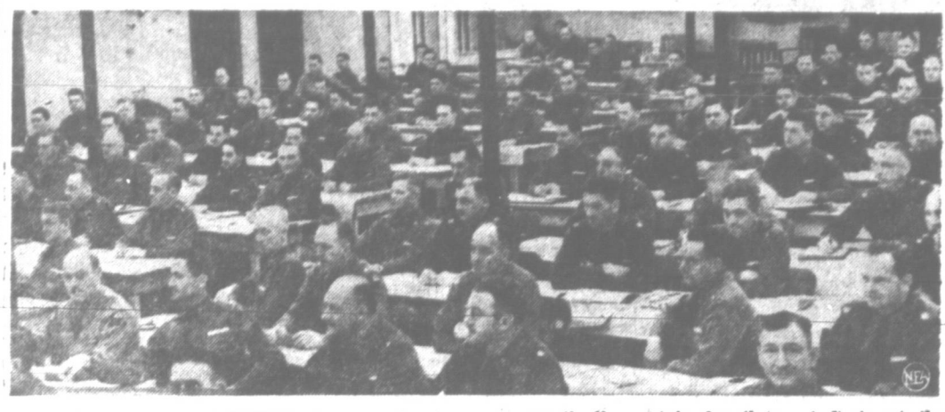
STARS IN THEIR FUTURE—A general's stars are practically certain for these students at the Army War College at Fort Leavenworth, Kans. The school is the apex of one of the nation's top educational systems.

WASHINGTON — (NEA) — Take any graduating class from the Army War College, close your eyes and point at random to any man in it.