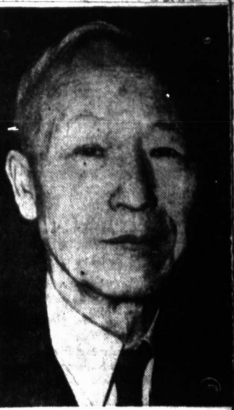
SYNGMAN RHEE JOB AT STAKE

MIAMI (AP)—The Laketon Miami farm-to-market road was completed here late this morning when construction workers shovelled the last swath of asphalt and spread the last box of stone along Main.