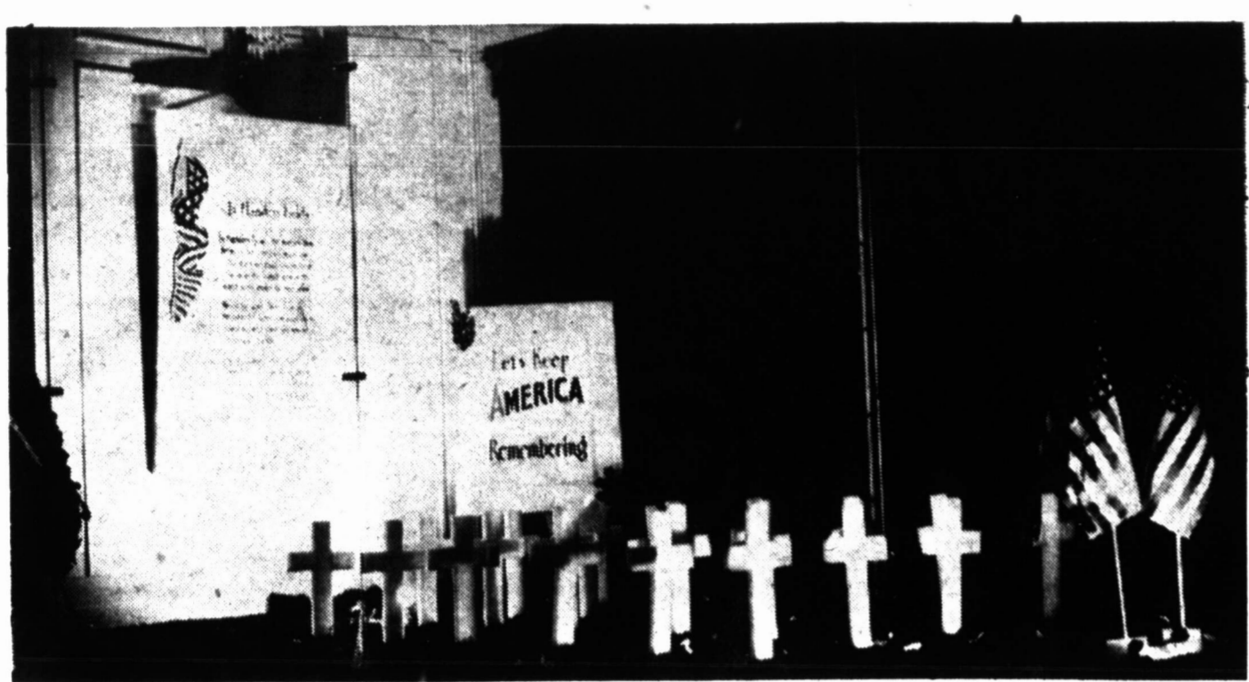
IN MEMORIAM—Today America passes to remember those who gave their lives that we, the citizens of Pampa, Texas, and of the U. S. A., might be free to worship whatever our gods may be, and be free to live as our conscience might dictate.