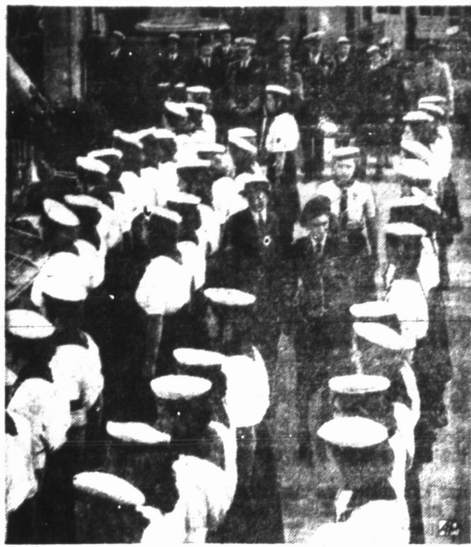
COMMODORE'S INSPECTION—Princess Margaret (right center), in uniform of Commodore, inspects a detachment of Sea Rangers training at Portsmouth, England.