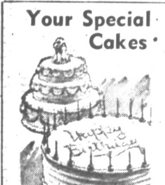
Made to Your Order

event cake call your order to Coston's. Your cake will be beautiful to look at, delicious to taste and ready for you