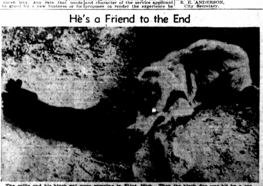
comping in Flint, Mich. Then the black dog od guard over his dead friend, at the spot The collie and his black pal were round killed. The faithful collie stood He refused to leave the body until the