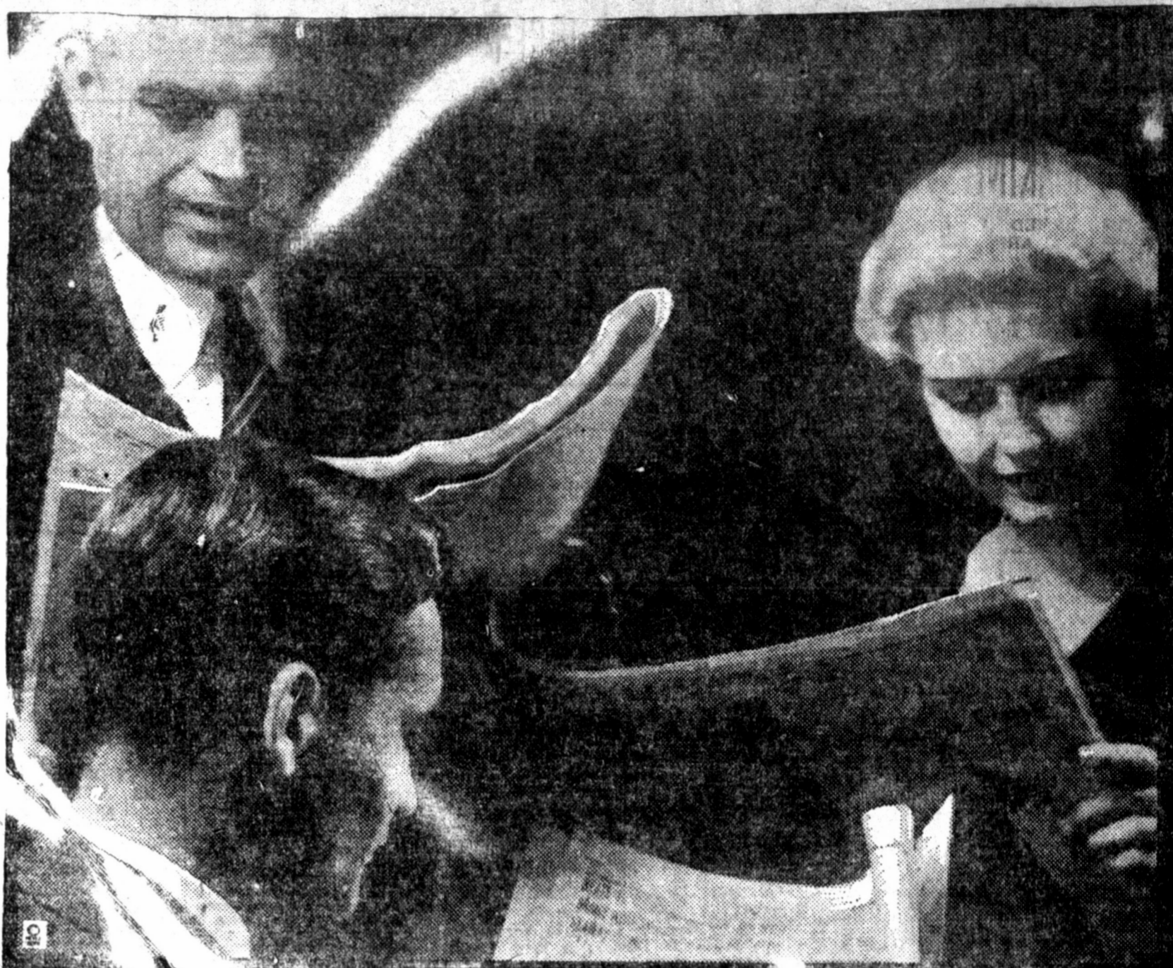
THE NEWS CONTEST OF ABSORBING INTEREST TO EVERYONE WITH ALL THESE PRIZES

This is a contest for folks who think and do things, and not for ne'er-do-wells that talk and owe and thru false pride are afraid of work.