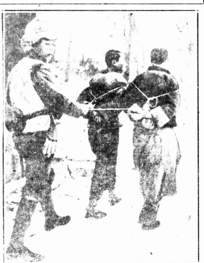
Driven along "in harness," two captive Chinese bandits are shown in this unusual picture as they were led to prison barracks by a Japanese soldier in the Manchurian war zone. One prisoner wears members of bandit forces which have molested the Japanese army. Note how securely they are bound.