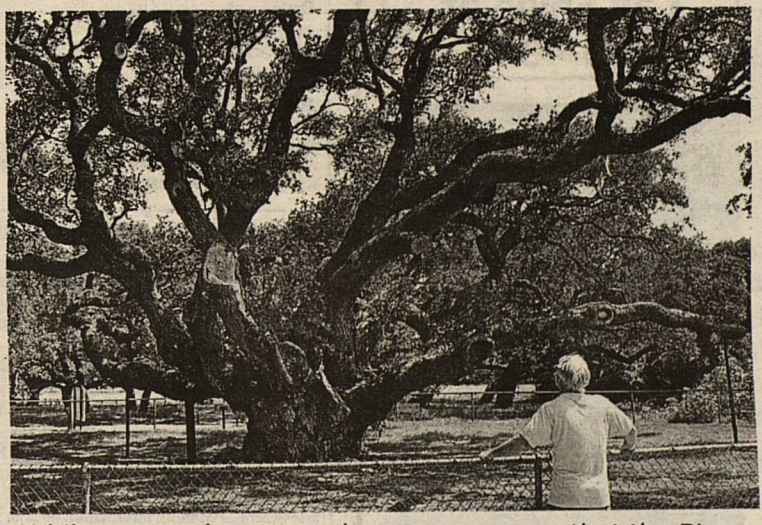
While you can't get too close, you can see that the Big tree is certainly that: it's over 1,000 years old.

LaSalle had visited down a skinny road near St. long ago and later German immigrants began their trek Over 1,000 years old, the to Central Texas from that Stinky Beach