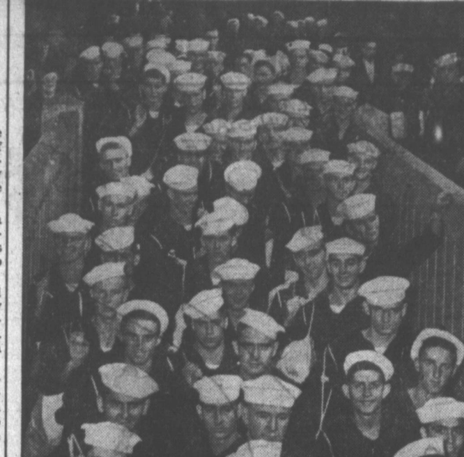
All of them midwesterners to whom the vast oceans are just something they read about, these U. S. Naval recruits will get first-hand experience on the briny deep in the Pacific...