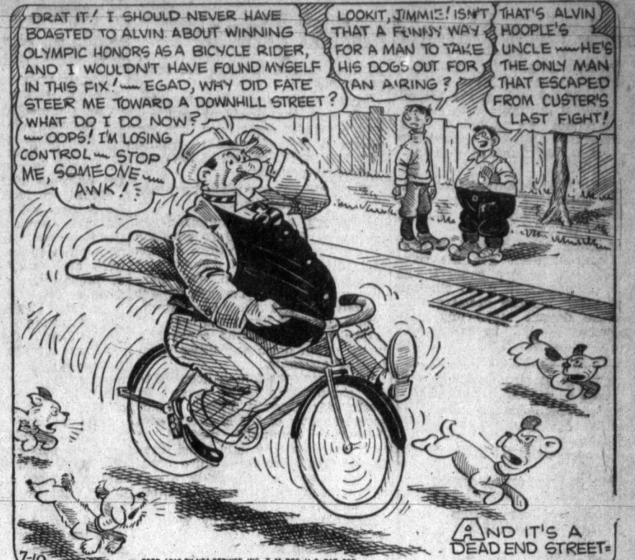
AND IT'S A DEAD END STREET