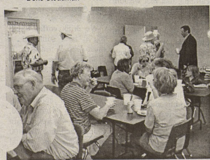
Friends gather for refreshments following ceremony.