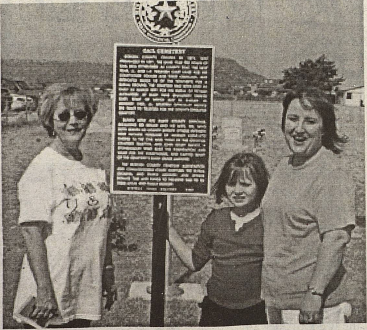
Members of the Wilbourn family: