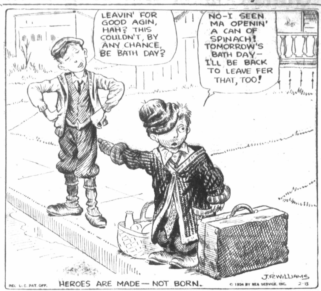
HEROES ARE MADE—NOT BORN.