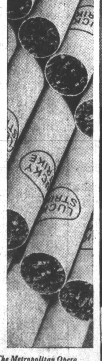
The Metropolitan Opera Over NBC Red and Blue Networks Saturday, 2 P. M. Eastern Standard Time, LUCKY STRIKE presents the Metropolitan Opera Company in the complete Opera, "Don Giovanni"