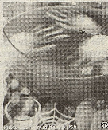
"Hand"-made punch is a real scream.

For more spookalicious recipes and Halloween activities, visit VeryBestKids.com.