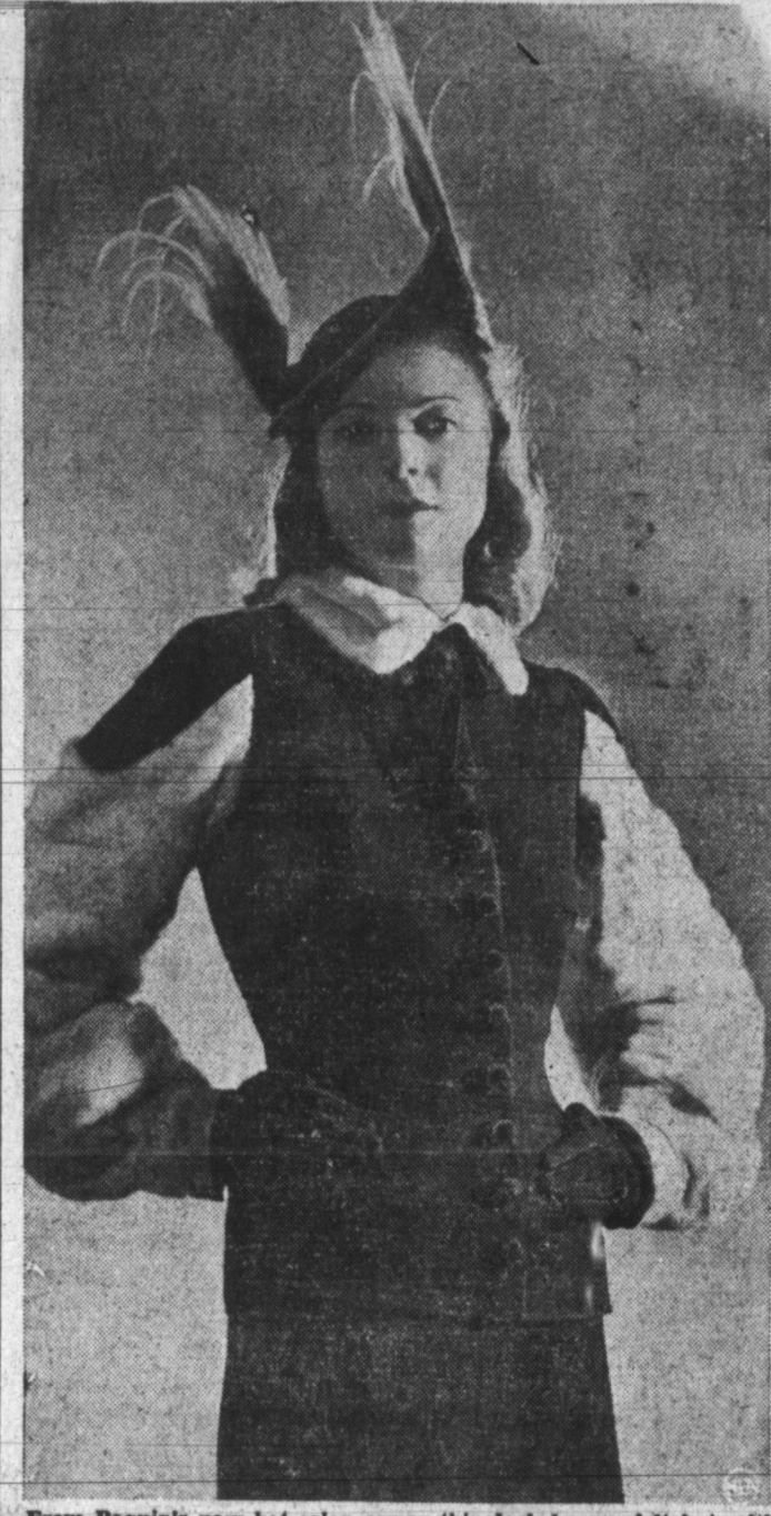
From Paquin's new hat salon comes this dark brown felt hat with bird of Paradise trimming.

The Greek letter "alpha" comes from the Greek letter A, or alpha, and the Greek letter B, or beta.