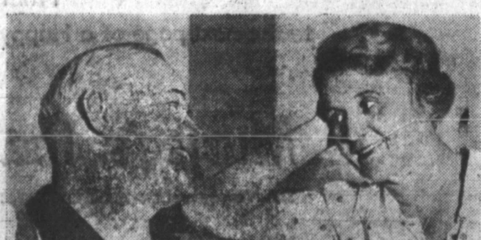
Defendant of the year: James J. Hines, with wife, his "prettiest girl in the world," during graft trial.