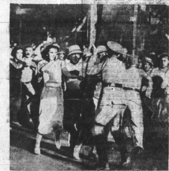
JERUSALEM a strife-center all year. Here police built a Jewish demonstration against Arabs.