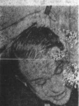
Prober of the year: Martin Dies.