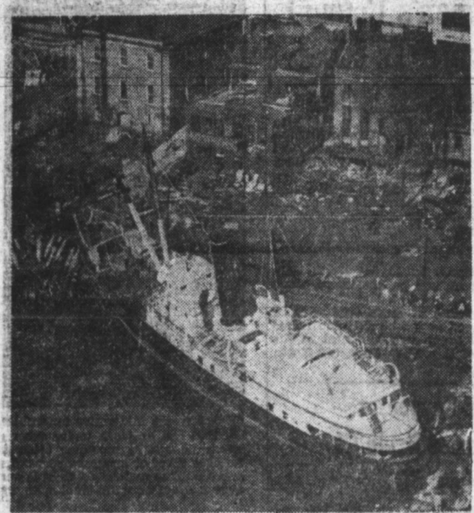
STORM of the year was the New England hurricane. Steamers washed ashore, this one at New London, Conn.