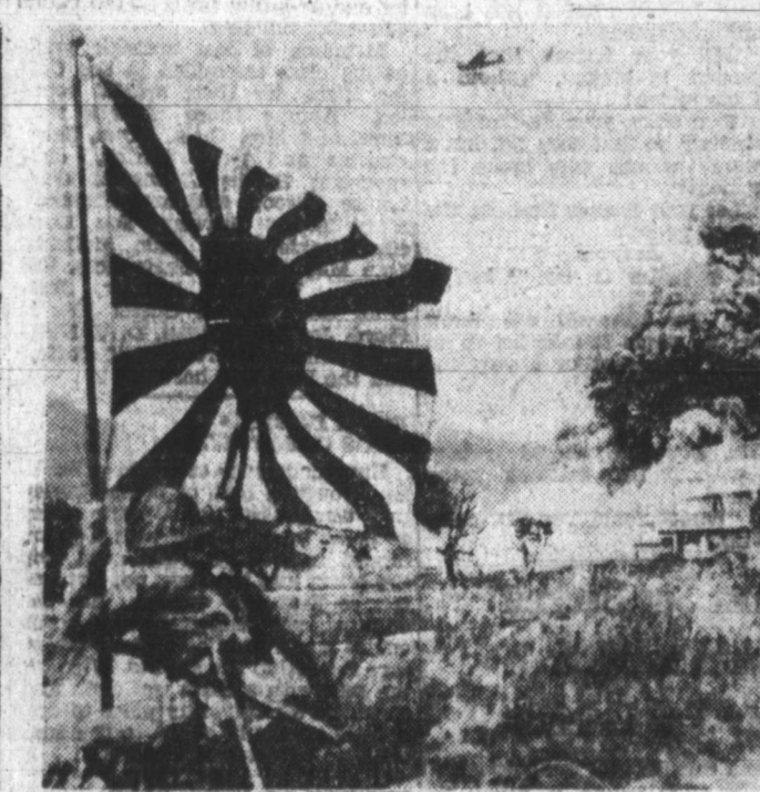
CONQUEST of a great part of China became fact. Japanese flag was death symbol for thousands.