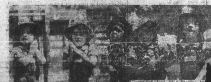
Darlings of the year: the Dionne quintuplets, who sang over radio in movie "Five of a Kind." Tonsil-adenoid operation highlighted their life.