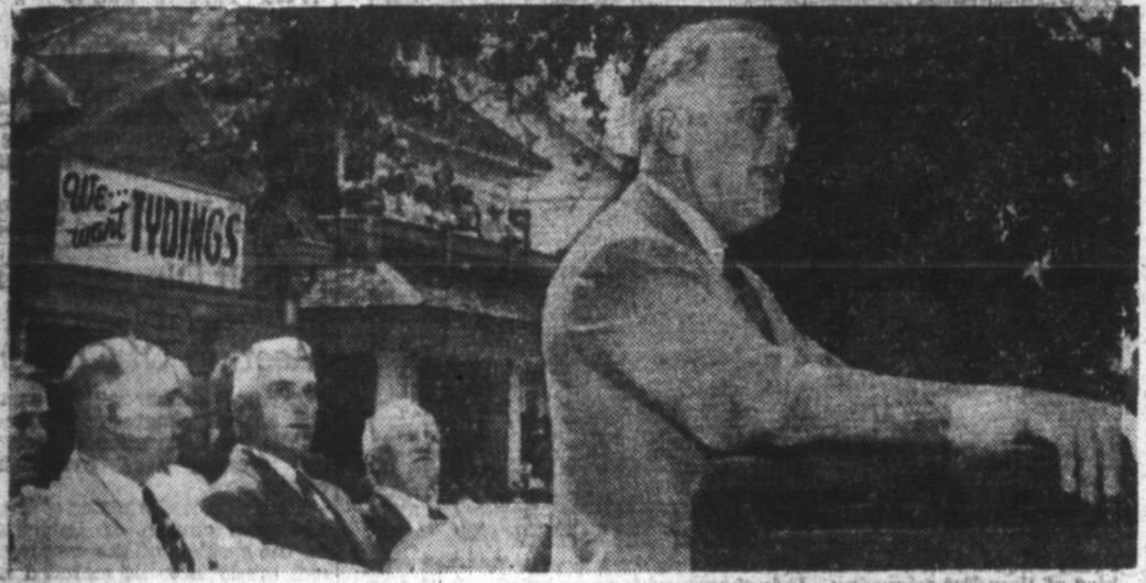
PURGE that failed. This picture—Mr. Roosevelt speaking for Lewis in Maryland before a Tydings sign—tells story of primary setbacks handed President by conservatives.