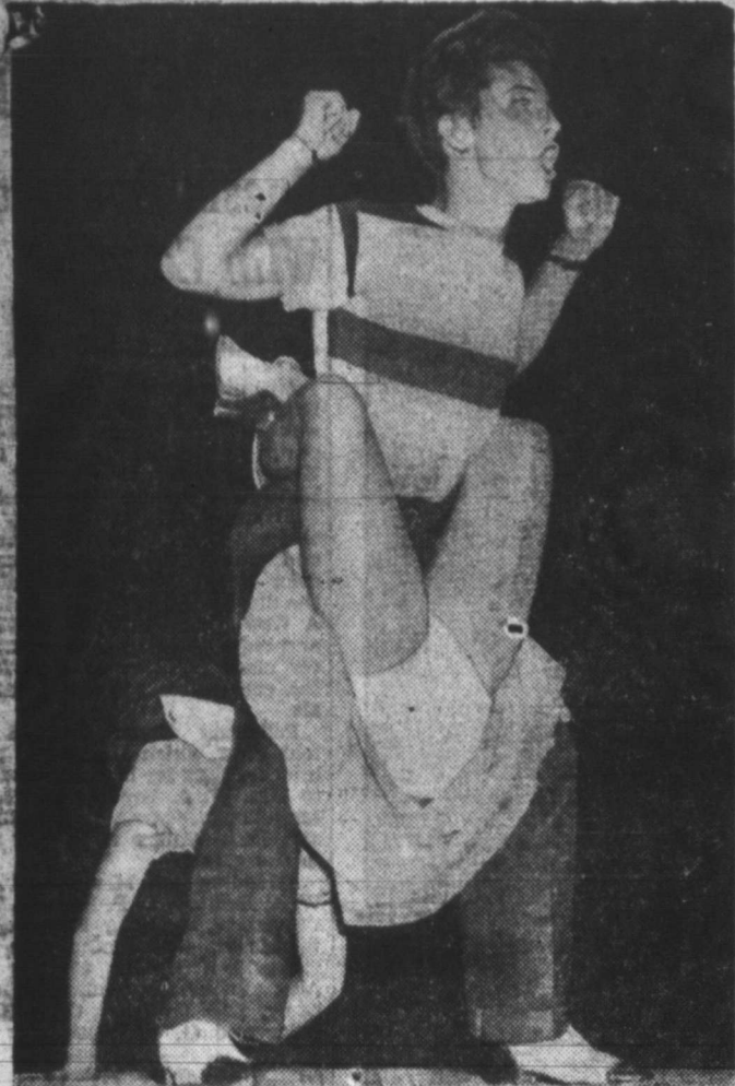
SWING kept hold on nation. Jitterbugs like these Los Angeles youngsters mowed 'em down everywhere.