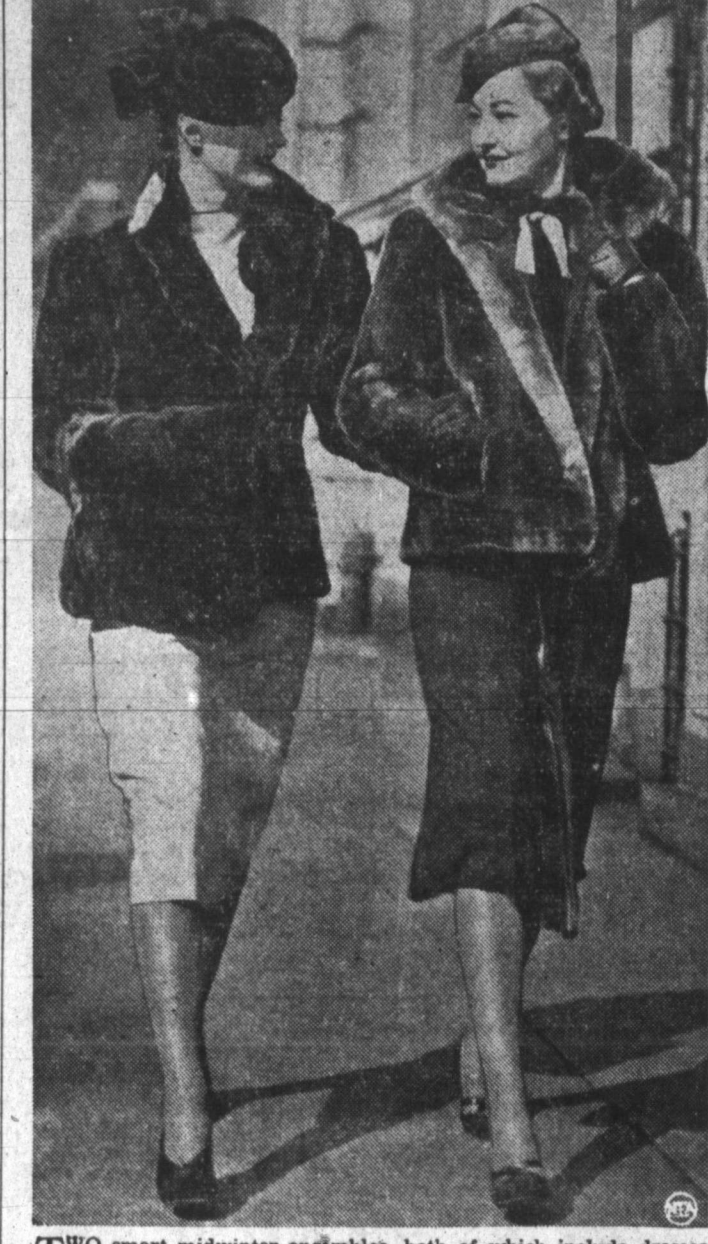
TWO smart midwinter ensembles, both of which include dresses that can be worn under other coats and chic fur jackets which would be equally nice over other dresses.