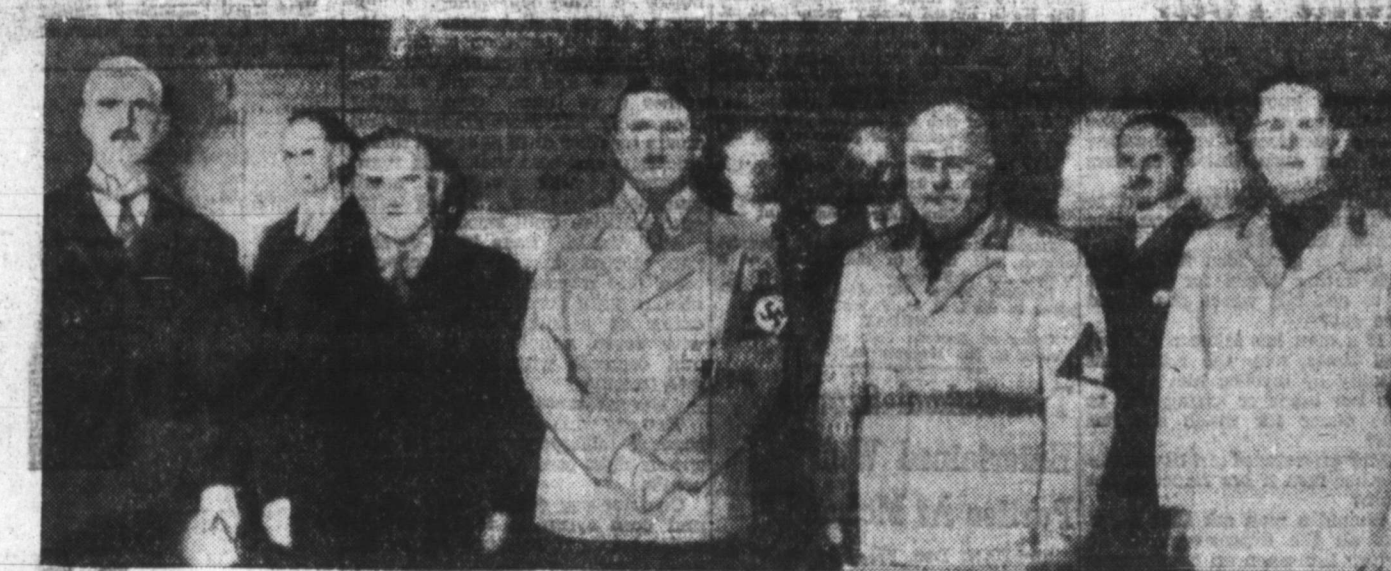
MUNICH saw heads of major powers gather to arrange a widely-decried peace. Radiophoto flashed picture-news to a war-fearful world. Left to right: England's Chamberlain, France's Daladier, Germany's Hitler, Italy's Mussolini and Ciano.