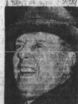
Politico Mayor Hauec.