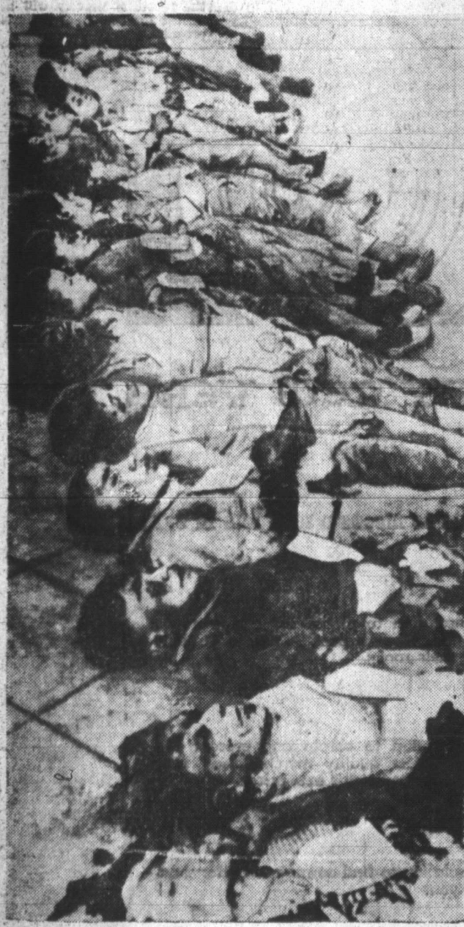
CHILDREN of Spain after insurgent bombing of Barcelona. Powerful picture-sermon against war.