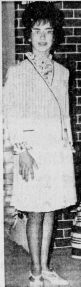
Model Karen Parks is wearing a Jr. Petit 3 piece suit by Jr. Petit Fashions of New York. Fabric is Fortel and avril. Skirt is pleated double breasted blazer collarless jacket with 5/8 length sleeve. Blouse has ruffled neck and cuff to complement the printed jacket which is 100 per cent cotton. All styled with the Jr. Petit figure in mind. Bone color baby alligator tear Sophisticated heel shoes by Portraits complete the ensemble.