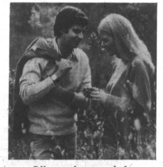
Like getting married

The best things in life are not free They cost money Serious money