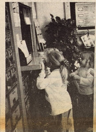
Make sure this gets to the North Pole!

when she passes the gavel to the newly elected president at the State Convention.