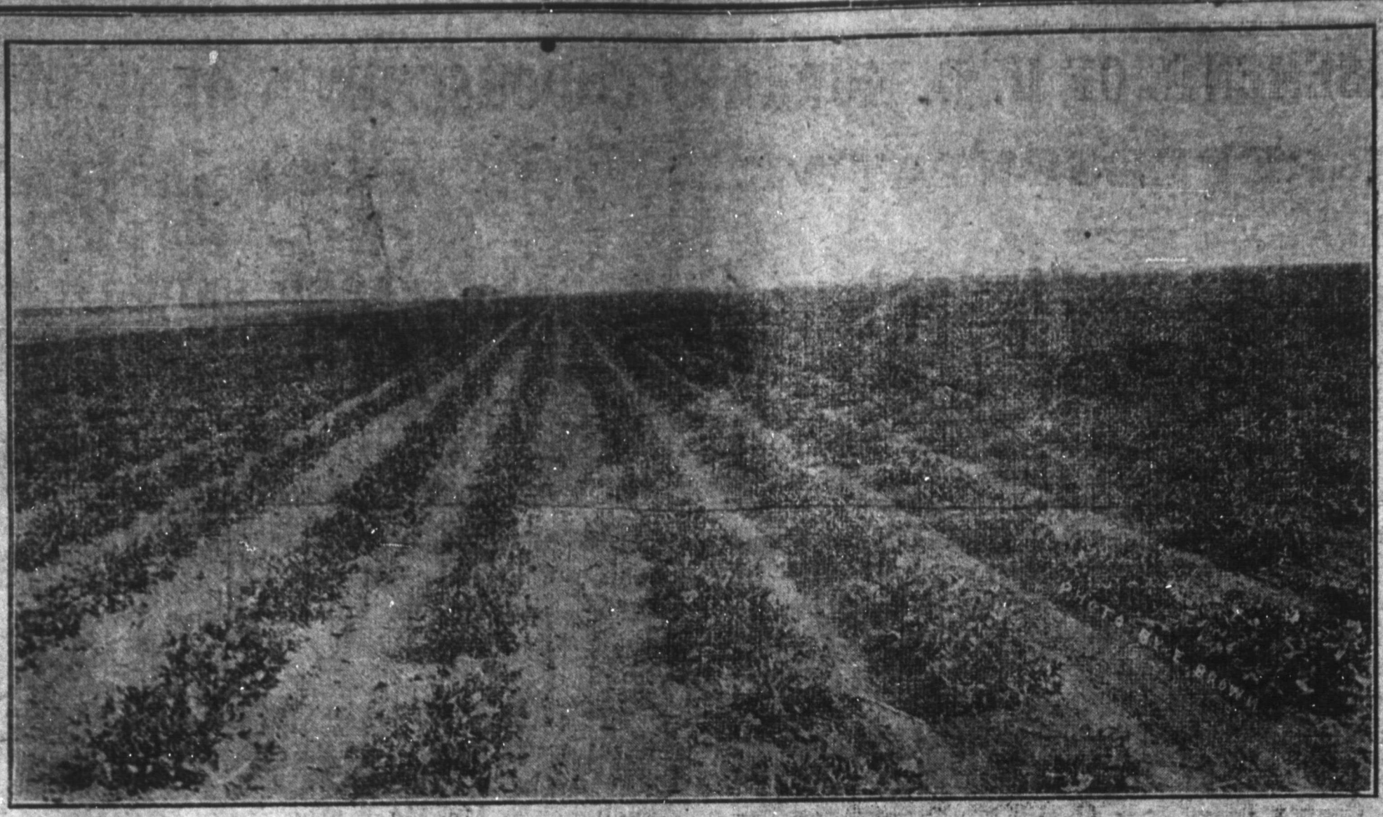
A Field of Peanuts, The Ideal Hog Range.