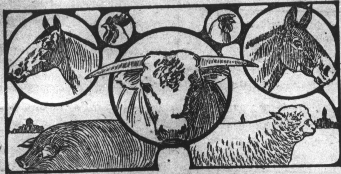
THE TEXAS BARNYARD.

When Uncle Sam wants to bring all the nations of the earth to a full realization of their dependency upon him for their very existence, he takes them through his Texas barnyard—13,000,000 head of live stock—and when he opens the gate and turns our stock out in a pasture as large as the German Empire, almost as great in area as the thirteen original colonies, three times larger than Japan, it is the grandest sight in 20th century civilization.