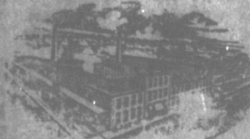
The Adler Factory—Greatest in the World

Stool, seat and instruction book given with every piano. Send for catalogue and buying plans.