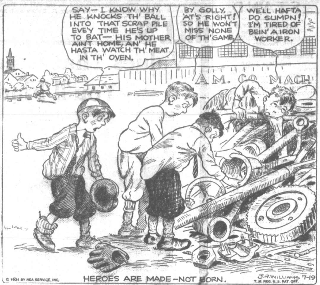
HEROES ARE MADE—NOT BORN. J.R. WILLIAMS 7-19 T.M. REG. U.S. PAT. OFF.