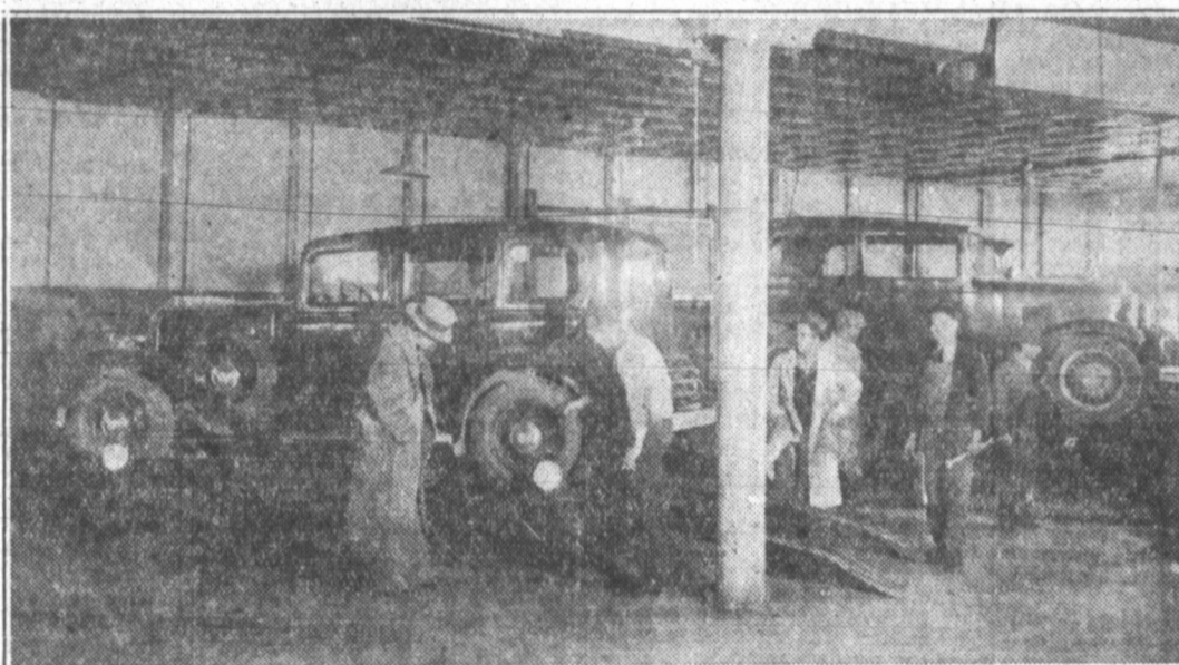
View of Cowdrey Brake Testing Machine

Another modern machine is used to scientifically align the wheels and strengthen the axles as the manufacturer intended them to be. Cars that "shimmy" are dangerous. Wheels out