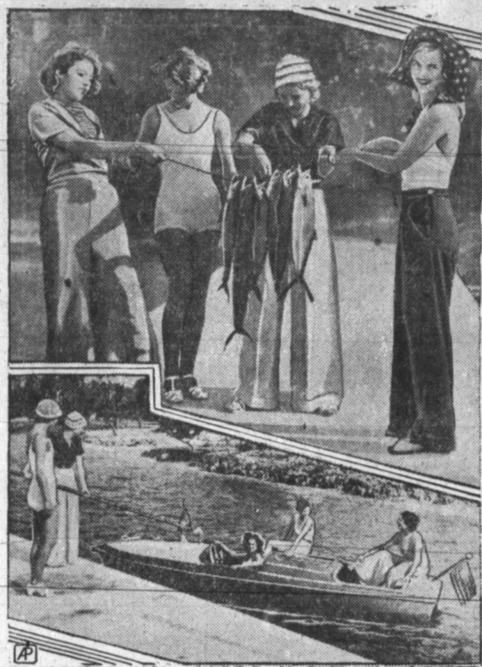
Angling is a favorite sport with feminine resort goers this season and it has brought out some novel outfits. Those shown above are typical.