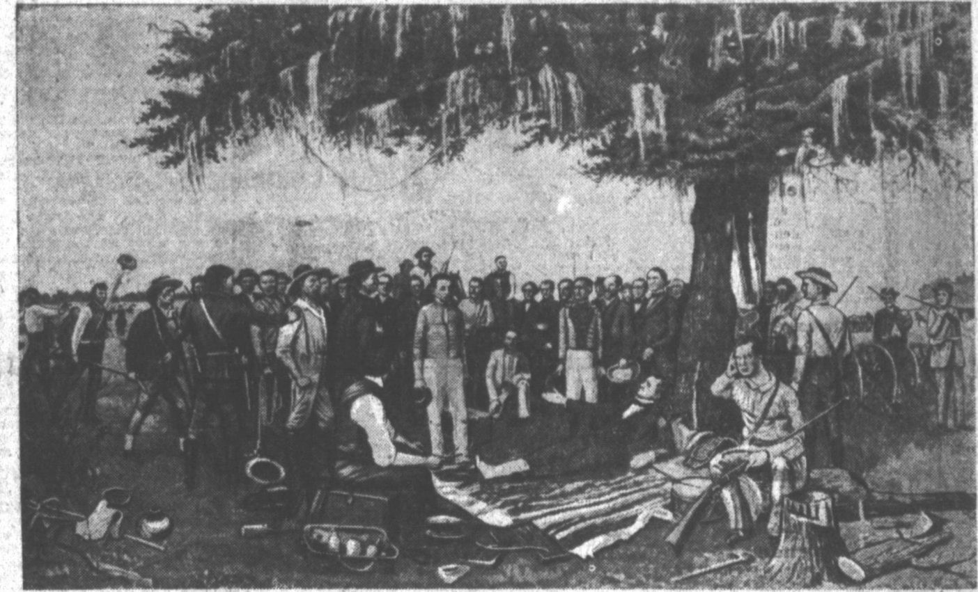
SANTA ANNA SURRENDERS TO HOUSTON (From a Painting by W. H. Huddle in the Capitol at Austin, Texas)

A FIFTEEN minute battle, ninety-five years ago this month, changed the map of all America and brought the Pacific Coast within the political view of the Atlantic. A pitiful handful of men, principally from Louisiana, Arkansas and Texas, led by a stalwart Virginia-Tennessean, swept Santa Anna's proud army from the field of San Jacinto and set the seal of liberty on a domain soon to be extended from the Louisiana Purchase to the Golden Gate.