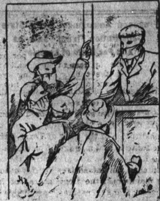
HALF A DOZEN MEN WERE UPON THEIR FEET AND PRESSED FORWARD.

In an instant everyone was upon their feet and eager to press forward to obey the bidding of the leader; yet the