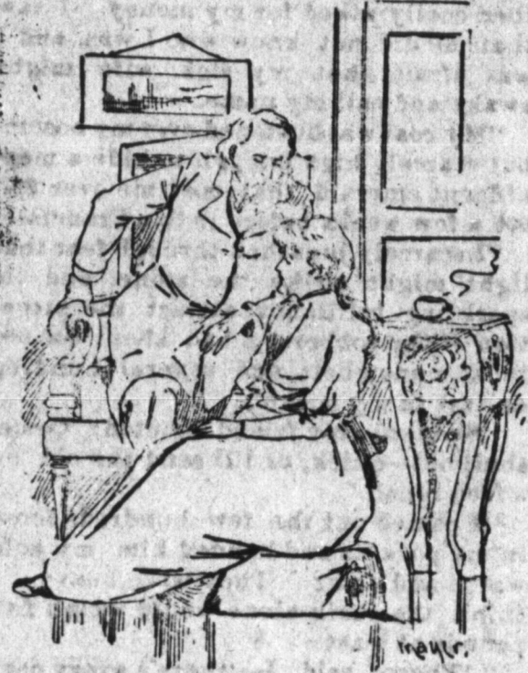
SEATED UPON A LOW OTTOMAN AT HIS FEET WAS A YOUNG GIRL.

In a spacious, high-studded, airy room sat a gentleman whose snowy locks showed plainly that he had long