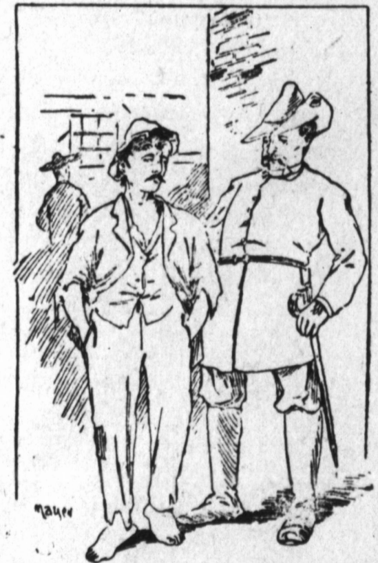
"WHO WANTS TO PLACE YOU IN THE CALABOOSE?"

"Ah, senor! Those are the first kind words which have fallen on my ear for many, many months, but they only serve to make me feel my degradation the more. I pray you, let me go. I