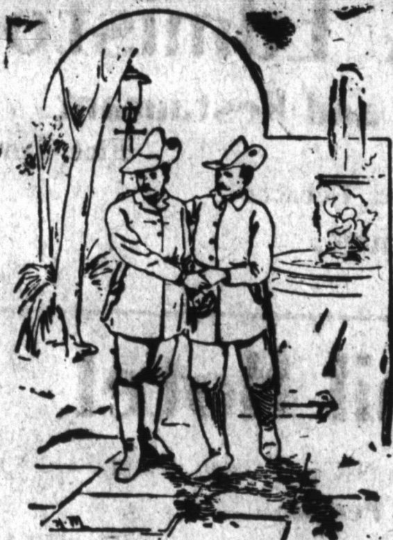
"WHAT IS IT, FRANCISCO, THAT IS TROUBLING YOU?"

the attention of army officers on soldiers, if such should happen to be about, and not to allow any of the populace to gather upon the street corners, but to keep them moving. Do you understand?"