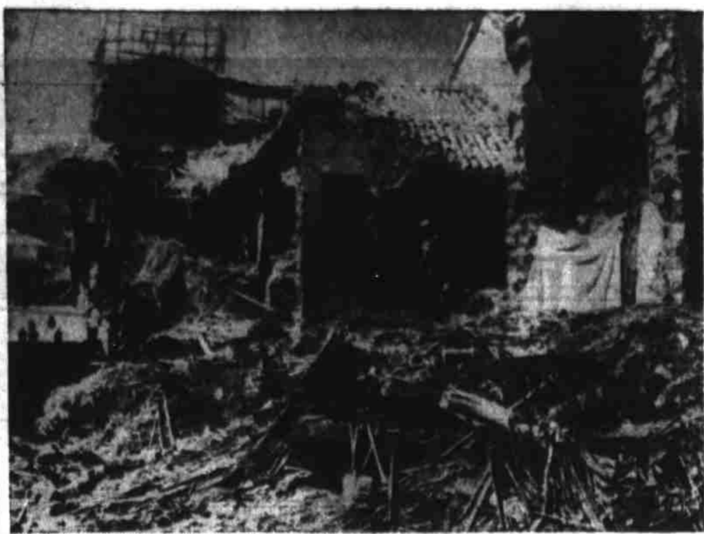
RUBBLE IN WAKE OF EARTHQUAKE —Rubble litters the ground at a corner of the Plaza de Armas in the center of Cuzco, Peru, in the wake of an earthquake which shook the city May 21. This picture was made by Charles Close, Pan American-Grace Airways pilot who flew a cargo plane laden with medical supplies to the stricken city. (AP Wirephoto).