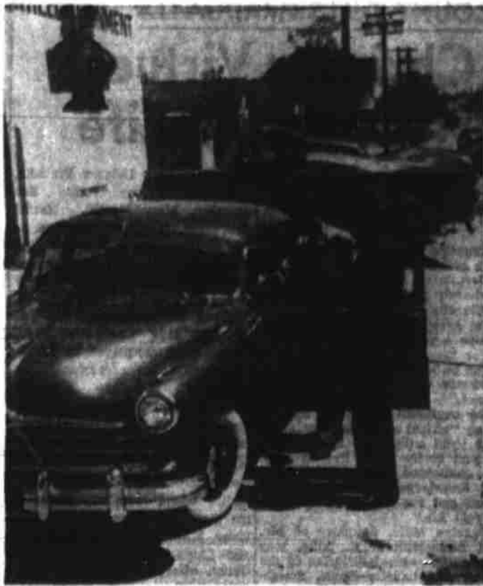
INSPECTING NEW HUDSON —W. C. Robinson, sales manager at the Eaker and Neel Motor Co., invites prospective purchaser to take a look at a new Hudson. In addition to retailing new Hudsons, the local dealers operate a modern shop for service and repair work, employing all modern equipment and experienced personnel.

Shop in cool comfort at O'Brien's Grocery, 1201 11th Place, personnel of the concern can tell you with enthusiasm. The air conditioning system of the store has recently been repaired and improved so that a constant temperature can be maintained within the establishment in the hot months just ahead. Big Spring's favorite neighborhood grocery store and market is located in a fast growing community and surrounded by plenty of parking space. The store maintains a frozen food compartment that proves especially popular with housewives, and, for that reason, with their families, during the summer months. Fresh fruits and vegetables, temptingly displayed are also available to the customers at O'Brien's. The fruits and vegetables are brought to the store several times weekly from the orchards and gardens of South Texas and Southern California. Huge refrigerator vans haul such items from the two localities, insuring them freshness. All lines of nationally advertised canned goods are also stocked by the O'Brien store, along with fresh meats of all grades and cuts.