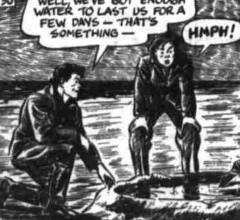
WELL, WE'VE GOT ENOUGH WATER TO LAST US FOR A FEW DAYS - THAT'S SOMETHING -