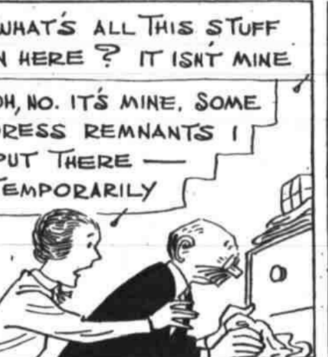
WHAT'S ALL THIS STUFF IN HERE? IT ISN'T MINE