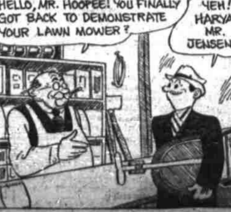
HELLO, MR. HOOPEE! YOU FINALLY GOT BACK TO DEMONSTRATE YOUR LAWN MOWER?