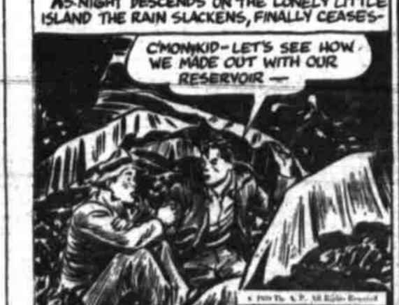
AS NIGHT DESCENDS ON THE LONELY LITTLE ISLAND THE RAIN SLACKENS, FINALLY CEASES-