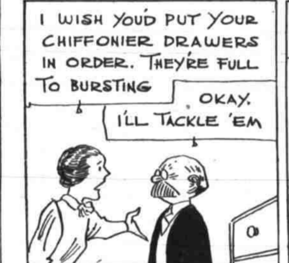
I WISH YOU'D PUT YOUR CHIFFONIER DRAWERS IN ORDER. THEY'RE FULL TO BURSTING