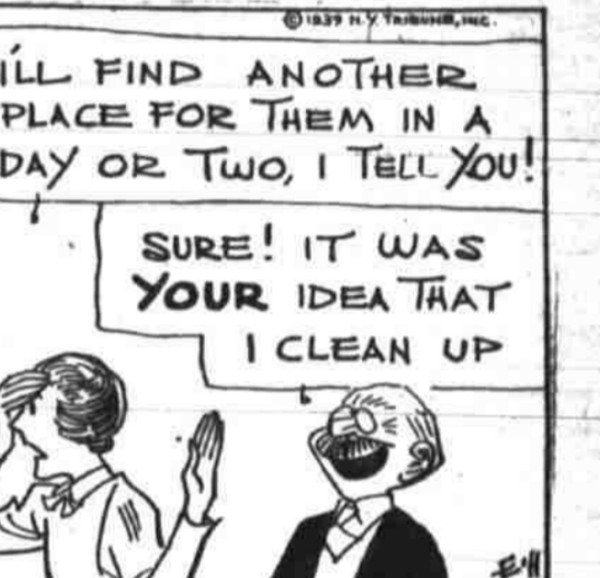
I'LL FIND ANOTHER PLACE FOR THEM IN A DAY OR TWO, I TELL YOU!