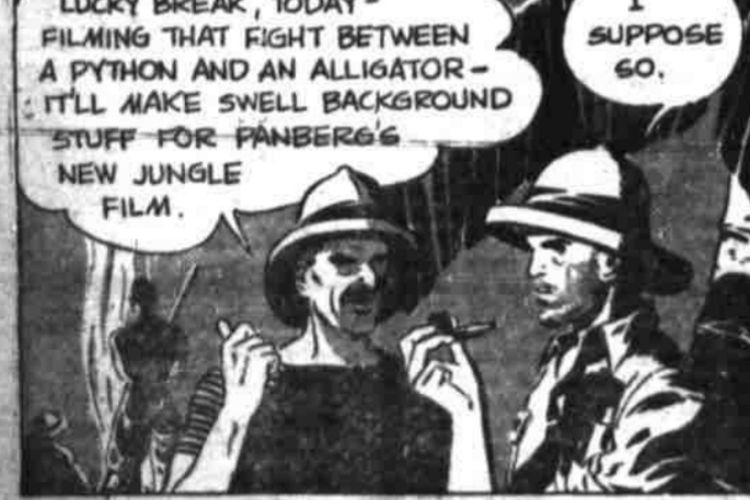
LUCKY BREAK, TODAY - FILMING THAT FIGHT BETWEEN A PYTHON AND AN ALLIGATOR - IT'LL MAKE SWELL BACKGROUND STUFF FOR PANBERG'S NEW JUNGLE FILM.