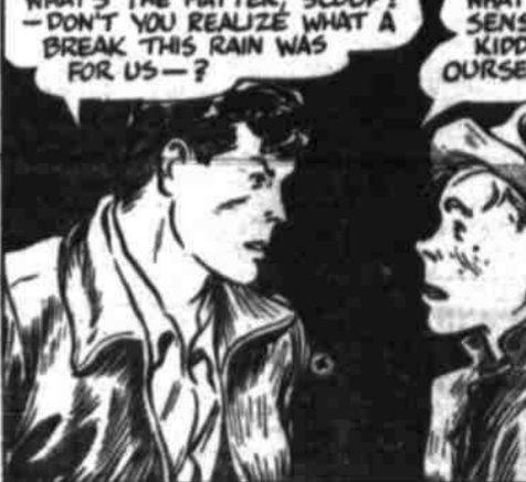
WHAT'S THE MATTER, SCOOP? - DON'T YOU REALIZE WHAT A BREAK THIS RAIN WAS FOR US -?