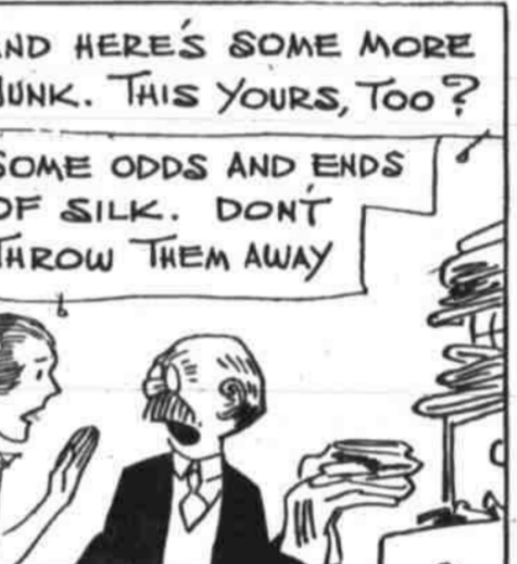
AND HERE'S SOME MORE JUNK. THIS YOURS, TOO?