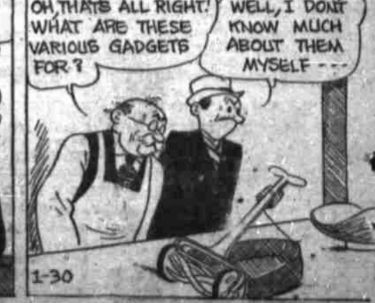
SEEMS KIND OF NUTTY TRYING TO SELL LAWN MOWERS THIS TIME OF YEAR... I HOPE NOBODY COMES IN AND SEES ME...