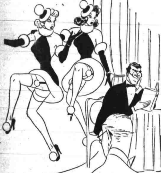
"They say he's a regular bookworm."

Trademark Registered U. S. Patent Office