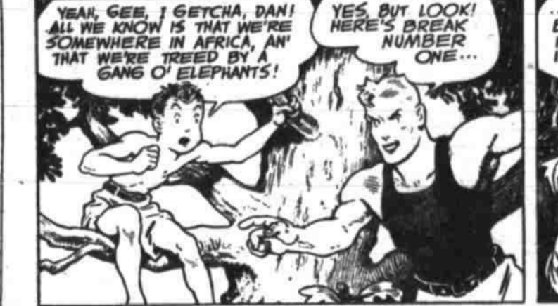
YEAH, GEE, I GETCHA, DAN! ALL WE KNOW IS THAT WE'RE SOMEWHERE IN AFRICA, AN' THAT WE'RE TREED BY A GANG O' ELEPHANTS!

Trademark Registered U. S. Patent Office