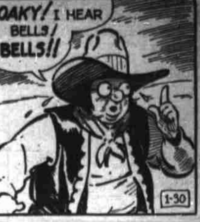
OAKY! I HEAR BELLS! BELLS!