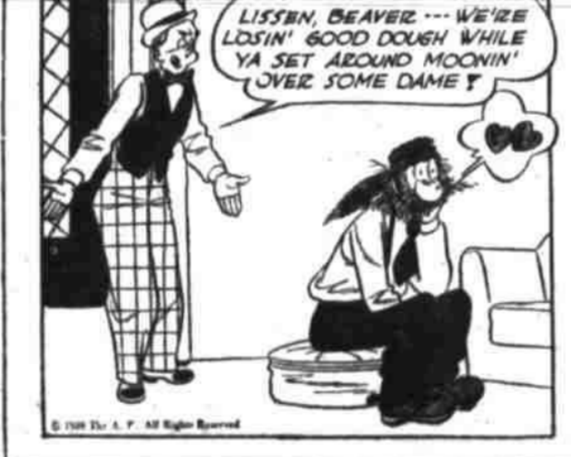
LISSEN, BEAVER... WE'RE LOSIN' GOOD DOUGH WHILE YA SET AROUND MOONIN' OVER SOME DAME Y