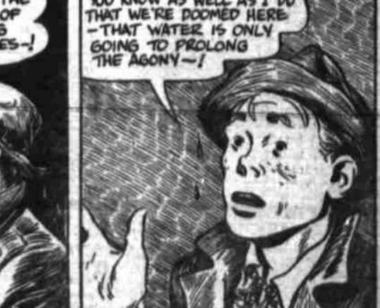
WHAT'S THE SENSE OF KIDDING OURSELVES!