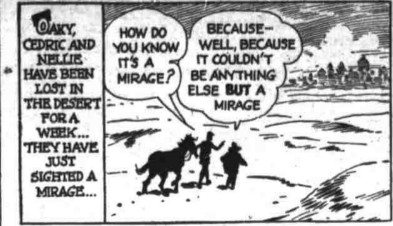
OAKY, CEDRIC AND NELLIE HAVE BEEN LOST IN THE DESERT FOR A WEEK... THEY HAVE JUST SIGHTED A MIRAGE...

Trademark Applied For U. S. Patent Office