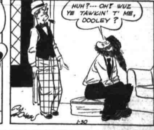
HUH?... OH! WUZ YE TAWKIN' T' ME, DOOLEY?