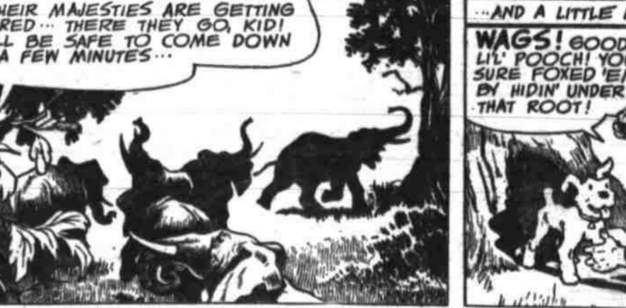
...THEIR MAJESTIES ARE GETTING BORED... THERE THEY GO, KID! IT'LL BE SAFE TO COME DOWN IN A FEW MINUTES...