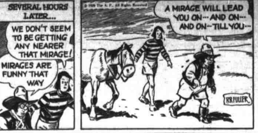
SEVERAL HOURS LATER... WE DON'T SEEM TO BE GETTING ANY NEARER THAT MIRAGE! MIRAGES ARE FUNNY THAT WAY