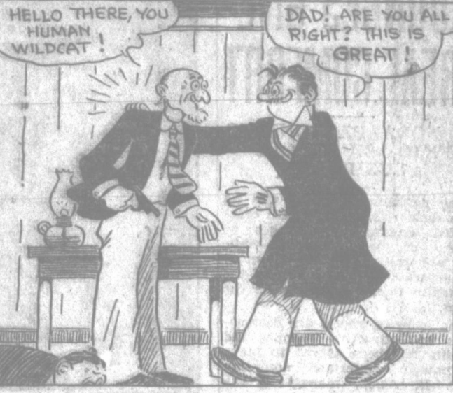
ROLLO ROLLINGSTONE Trademark Registered