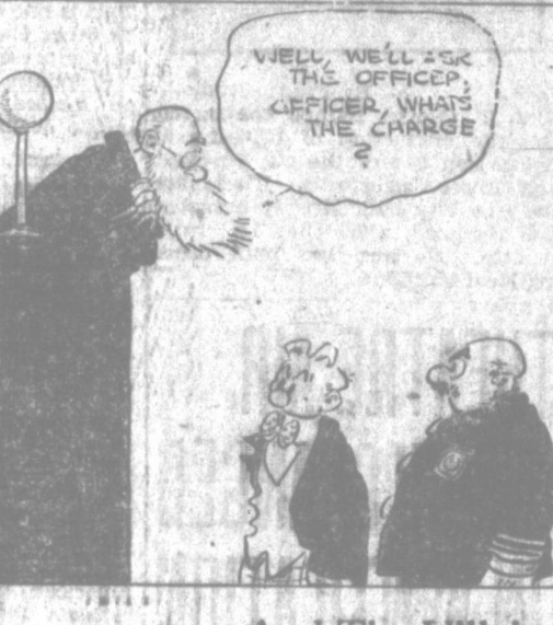
And The Willain Still Pursues Her