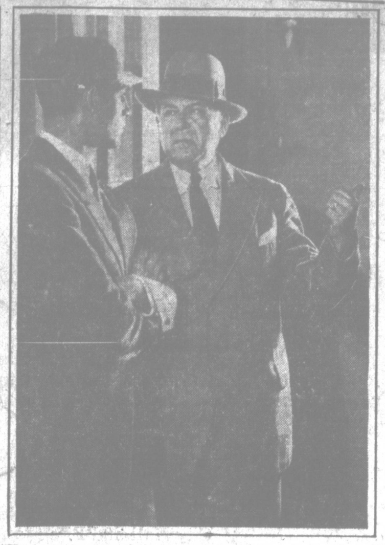
You mean—one of that gang of society folks in there?