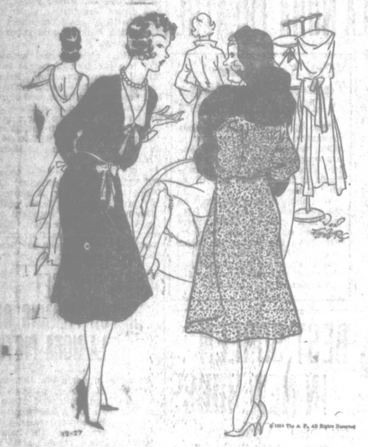
"No, something in a dress, Madame?"