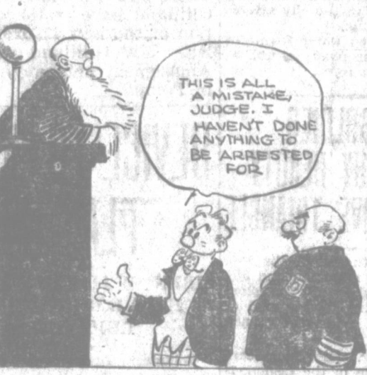
GLORIA Tendemark Registered U. S. Patent Office