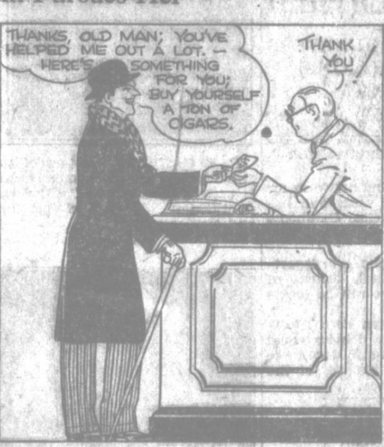
WHEN THE GOING'S AT ITS WORST