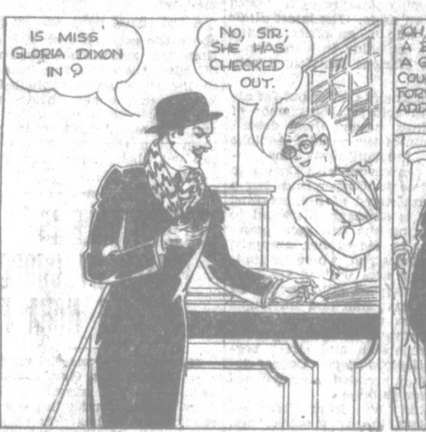
COLONEL GILFEATHER Trademark Restorers