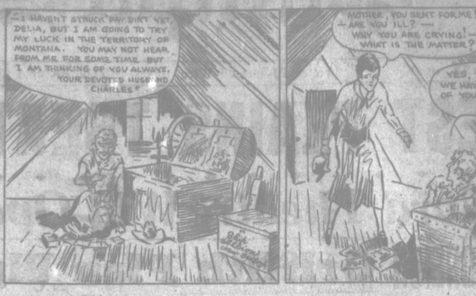
Dad Gets Into Action