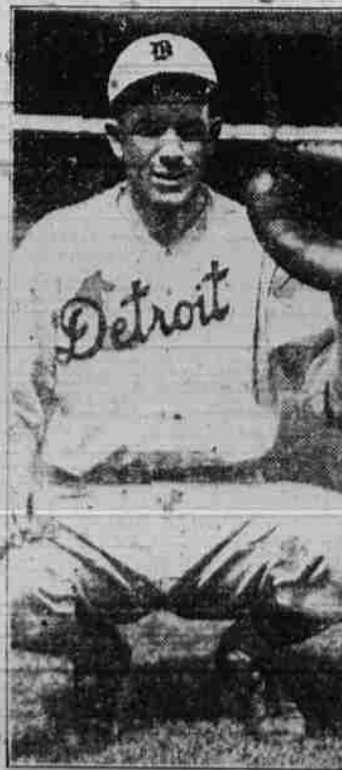
When Catcher Ray Hayworth of the Detroit Tigers dropped a third strike in the second game of a doubleheader in Philadelphia, he broke a perfect fielding record that dated back to Sept. 2, 1931. He had accepted 439 chances in 100 even games without a flaw.