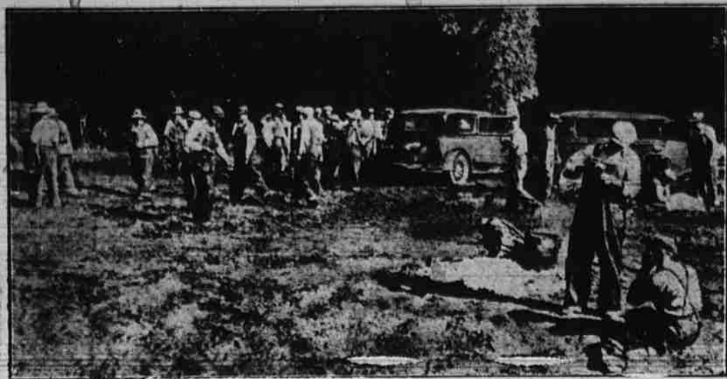
A group of striking Iowa farmers is shown encamped near Council Bluffs, Ia. In their drive to keep farm produce off the markets by stopping motor trucks, they have set up a temporary camp.