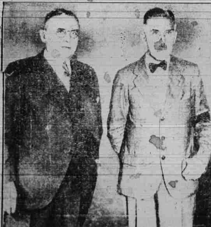
Mayor Anton Cermak (left), Chicago's traveling salesman, is shown with Chancellor Franz von Papen when he stopped off in Berlin to invite Germany's participation in the Chicago world's fair.