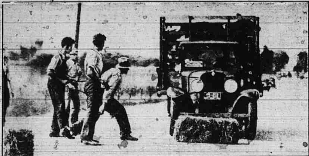
"Hay, stop that truck," seems to be the idea of the Iowa farmers shown here in the act of enforcing their road picket to keep farm produce off the markets. This load of cattle was "persuaded" to turn back to Jewell, Iowa.