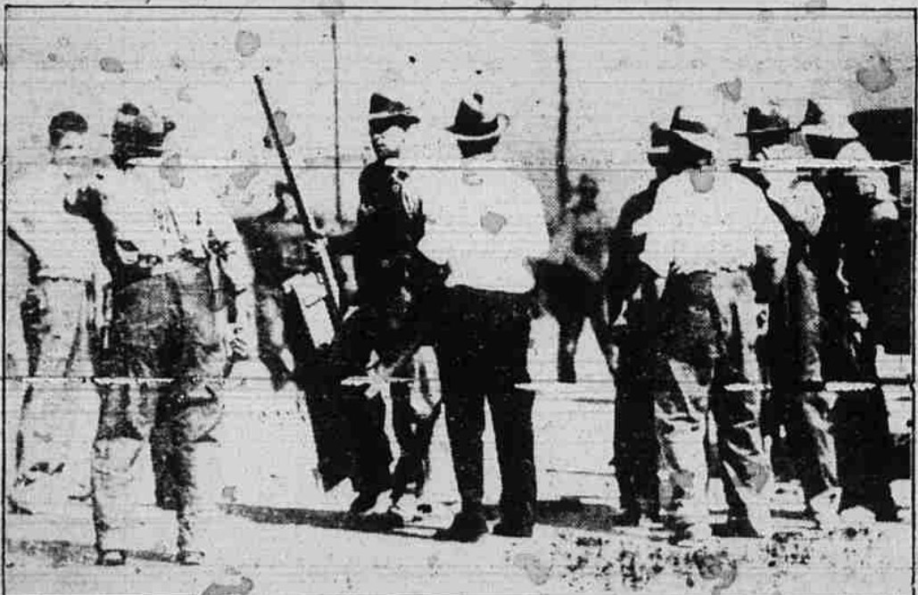
Running the blockade to market through striking farmers is strenuous and often dangerous business in Iowa. Several persons have been injured in clashes with pickets in the war for higher farm produce prices. Above is a scene near Des Moines, Iowa, as a farmer (left foreground) and two of his stalwart sons (backs to camera) "persuaded" farm holiday pickets to allow them to market two truck loads of produce. Each of the three is armed with a hammer brought along when they left their farm for market.