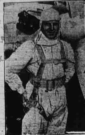
Emil Kropf, one of Germany's most famous aviators, is shown in front of his plane at the national air races at Cleveland.