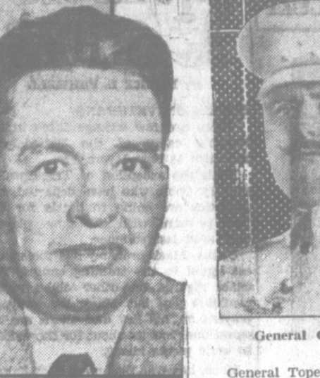
Governor Fausto Topete

ambassador at Washington received date of 461,294 barrels valued at with this device attached."